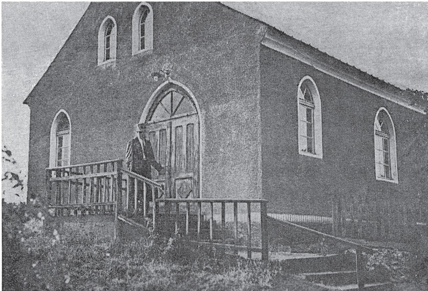
A pre-war photograph of the church in Selbongen.

The solitary building owned by the Church in Germany was a small structure erected in 1929 in the town of Selbongen, East Prussia. The property was donated by the Kruska family, who were branch members, and the construction was financed in part by the East German Mission. Local Saints experienced amazing and frightening events at the end of the war, but managed to hold on to their building until 1974, when the last Church members emigrated to the West. 13