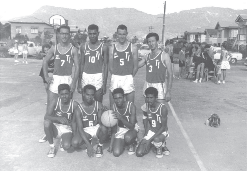
Members of Thursday Island's men's Wongais "A" and "B" basketball teams, 1961.