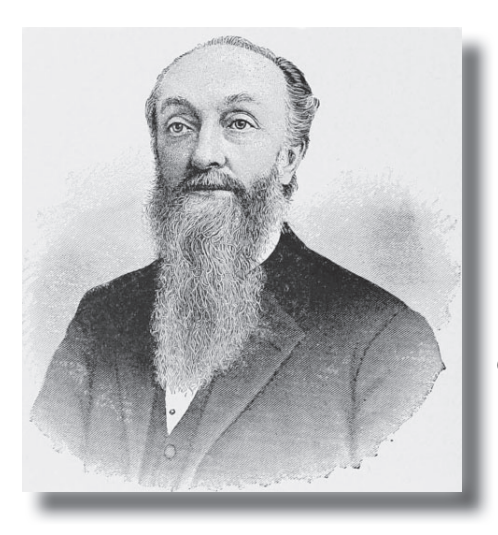
Charles Carrol Bonney, 1898. Bonney served as president of the 1893 World's Columbian Exposition in Chicago, Illinois. He also played an active role in organizing the Parliament of the World's Religions held in conjunction with the Exposition.

should focus on the "world of government, jurisprudence, finance, science, literature, education, and religion should be represented in a Congress," he wrote. The life of the mind and the heart needed to stand on equal—if not higher—footing than the industrial attainments of Western civilization.<sup>8</sup>