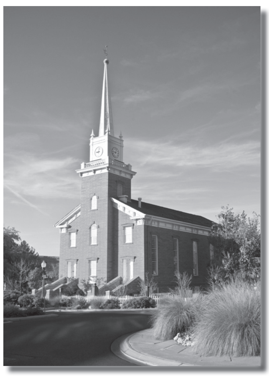
St. George Tabernacle