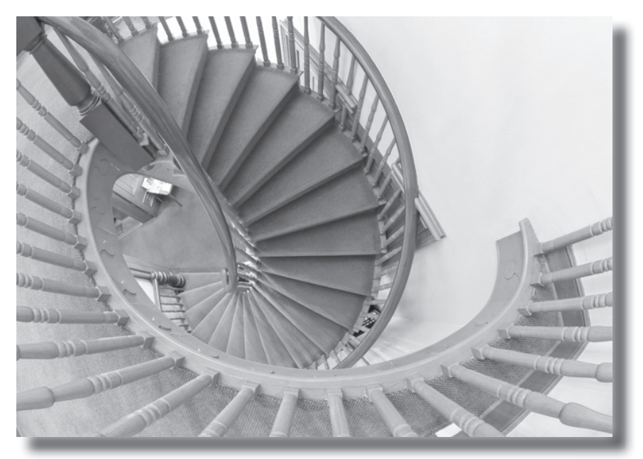
Interior view of the St. George Tabernacle's spiral staircase.

The renovations will not include remodeling, but repairing of the exterior, plastering, straightening the tower and balcony, adjusting the windows and shingling the roof.