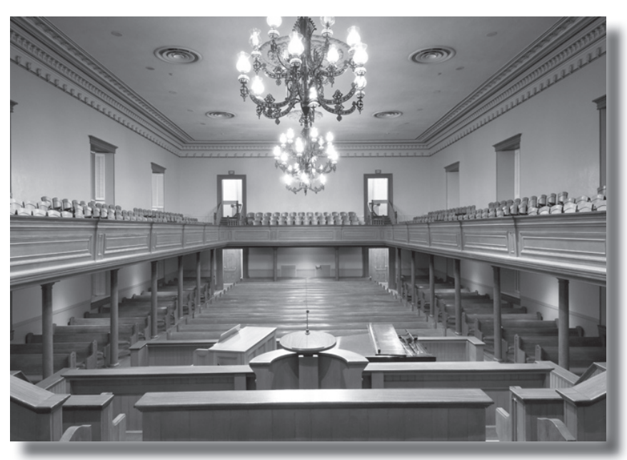
Interior view of the St. George Tabernacle from the choir seats looking to the east.