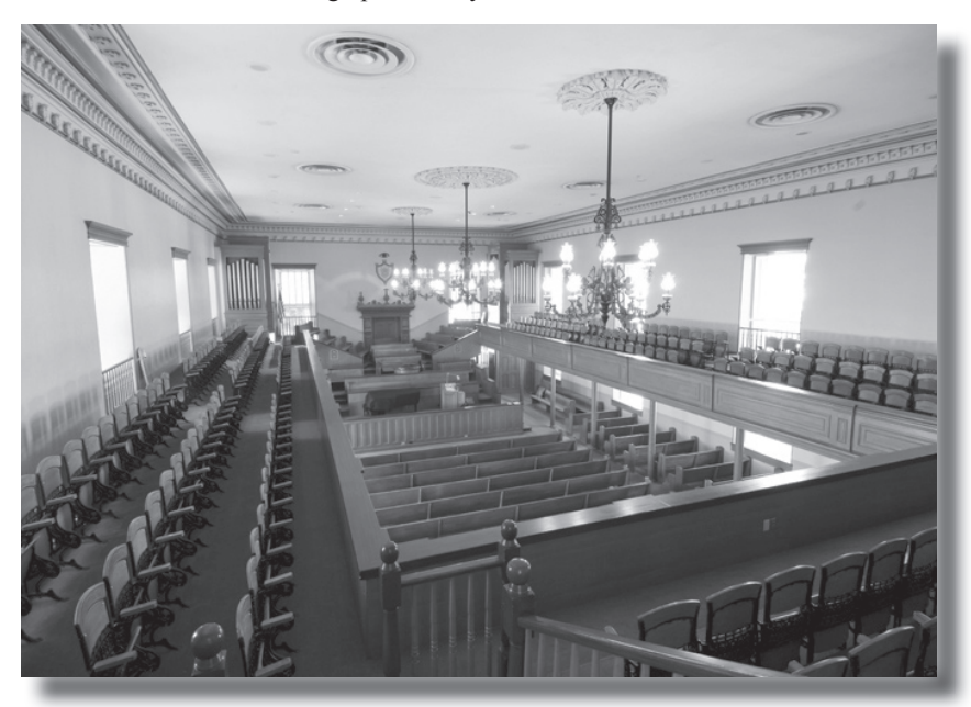
Interior view of the St. George Tabernacle looking to the west.