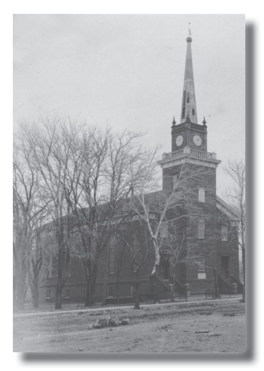
Images of the completed St. George Tabernacle, dates unknown.