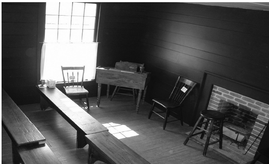
“School of the Prophets” room, situated in the northeast corner on the second floor of the Newel K. Whitney store, Kirtland, Ohio. The first session of the Kirtland School of the Prophets was held here from January–April 1833.

Though there may not be an express bridge linking Congregationalists and Presbyterians to Joseph Smith’s Kirtland School, one still clearly feels something of a connection there. Nevertheless, the more intriguing questions surrounding the 1833 convocation revolve less around its rhetorical heritage than its repurposed ecclesiastical implications.