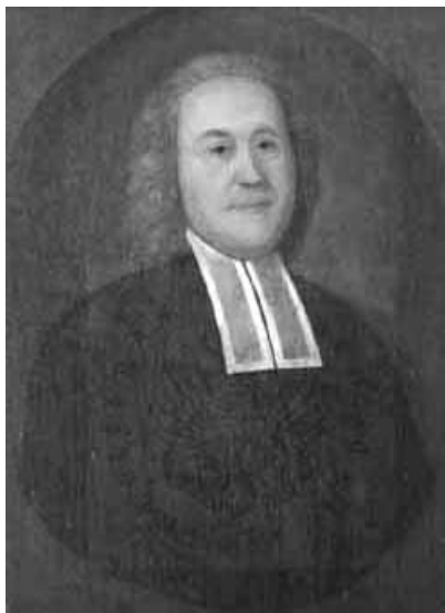
Gilbert Tennent, eighteenth-century Presbyterian minister, date unknown, painting attributed to Gustavus Hesselius.