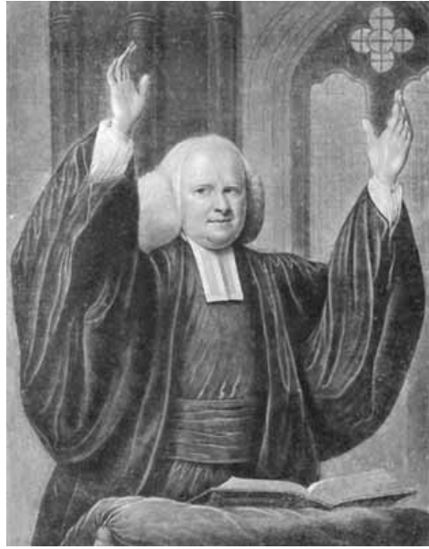
George Whitefield by John Greenwood, after Nathaniel Hone, 1769. Whitefield stood among those ministers who found Harvard and Yale inadequate in respect to ministerial preparation.

By the 1760s, a very conservative faction emerged within the New Light movement, far more passionate in regard to piety and conversion than the existing mainstream. Backed by Edwards' students Samuel Hopkins, Joseph Bellamy, and others, New Divinity "schools of the prophets" became the norm on the New England and mid-Atlantic frontiers. 15