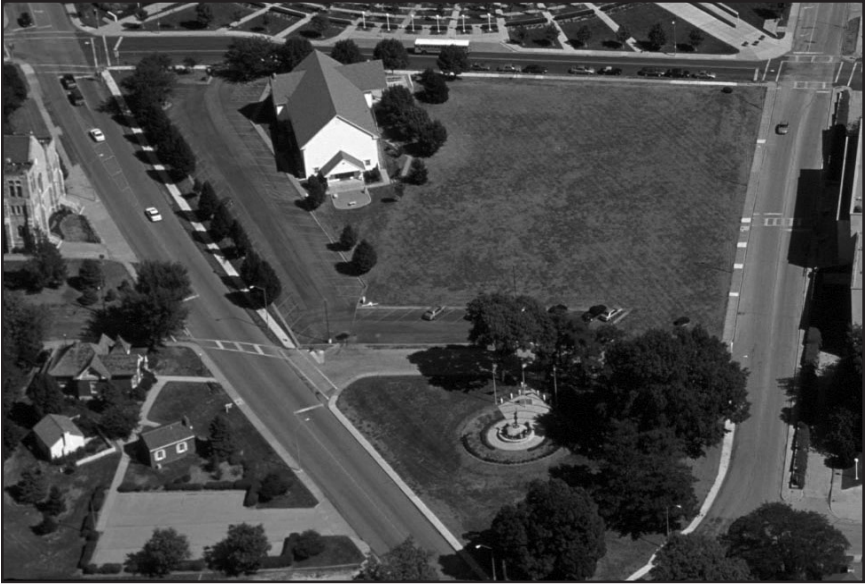
Aerial view of the Church of Christ (Temple Lot) property (2001).

With purchases made by the RLDS and LDS churches beginning in the late nineteenth century and continuing well into the twentieth century, the westward growth of the downtown and business areas of Independence was gradually but effectively stopped. 53 As religious structures were built on what had been vacant land, condemnation of the property was also avoided by government authorities for the building of schools or other government facilities. 54 With these acquisitions, Joseph's vision of the nature and use of this land has been more fully realized as representatives of the "Restoration movement" have reasserted controlling interest.