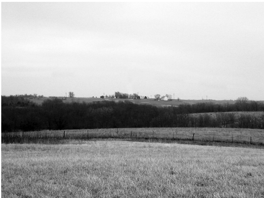
Photograph from the approximate location of the Far West burial ground situated about a mile west and a half-mile north of the Far West temple site, January 2003. The Far West temple site and the Community of Christ meetinghouse can be seen in the center of the photo.