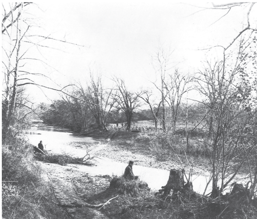
Site of the Battle of Crooked River, May 15, 1907.