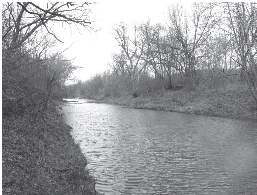
Site of the Battle of Crooked River, November 20, 2008.

the Des Moines River, and later the Mississippi. Once in Illinois, the Mormon escapees found refuge downstream at Quincy. 9