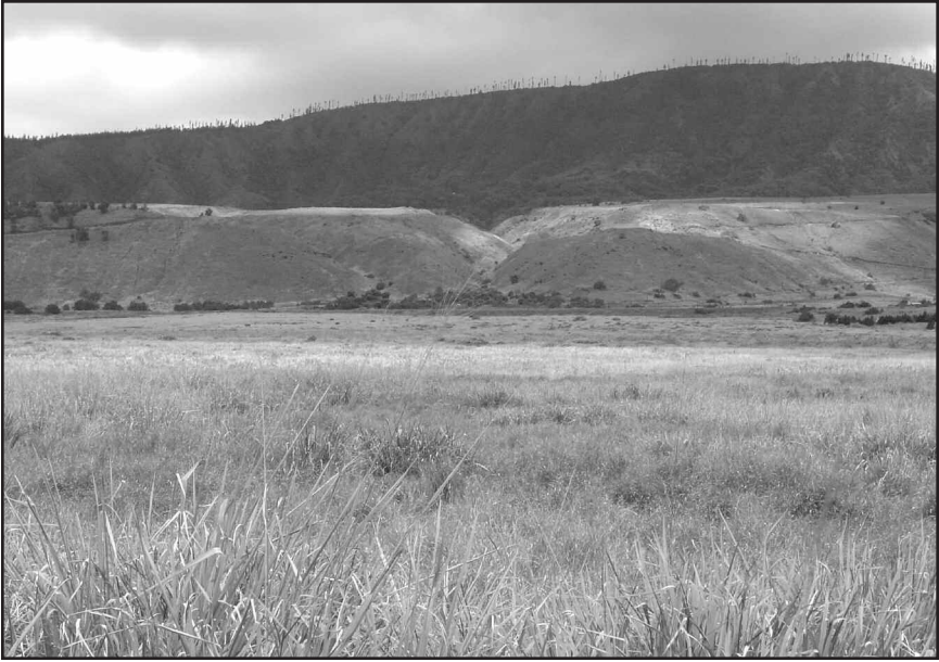
Palawai basin, first gathering place for the Latter-day Saints in Hawaii, October 2004.