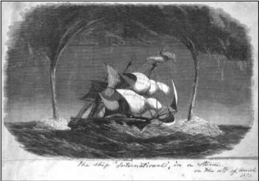
The captain and most of the crew of the International were baptized, due to the example and teaching of the Saints on board.