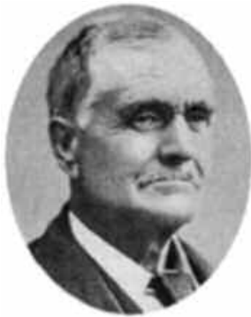
Joseph Clements. From Pioneers and Prominent Men of Utah.

THE DAILY PICAYUNE (New Orleans) 1 May 1840