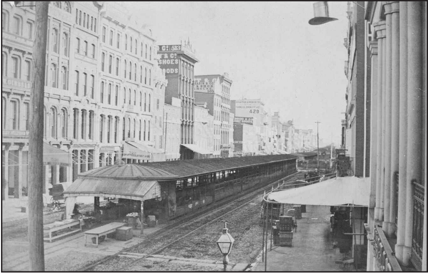
Market Street, east from Sixth Street. This is an 1859 albumen print, photographer unknown. The market sheds of Market Street (formerly High Street) are shown. A hat in the upper right corner is a tradesman's sign. Courtesy Print and Picture Collection, The Free Library of Philadelphia.