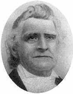
William Wardsworth.