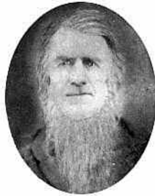
William Cornwall Patten.