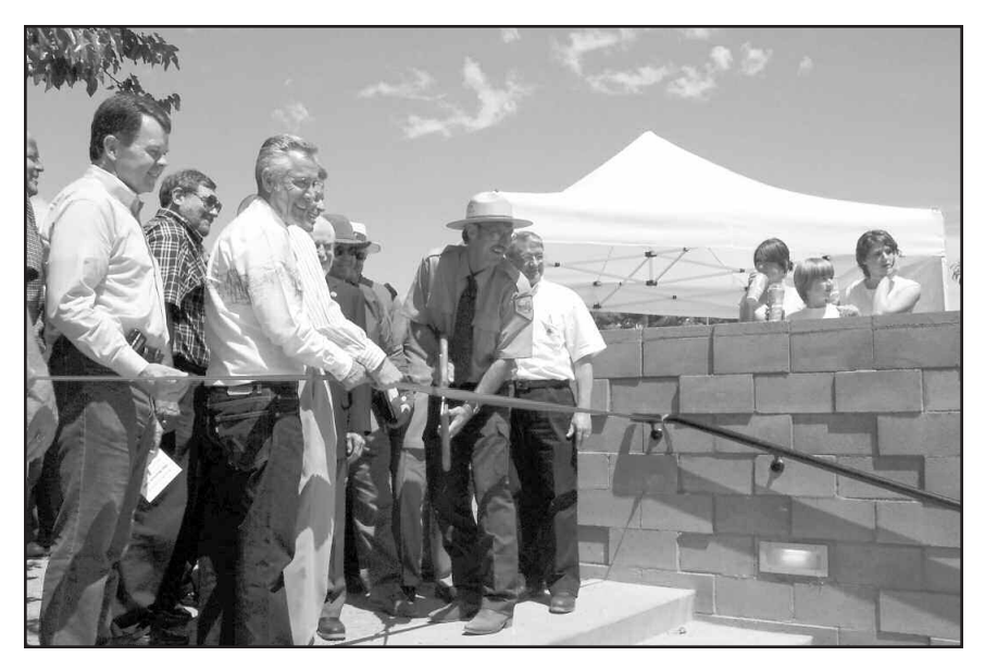
Ribbon cutting ceremony of the new Mormon Fort Stake Park visitors' center in Las Vegas, Nevada, 11 June 2005.

were conducted late into the day. An estimated three thousand people attended the anniversary events.<sup>1</sup>