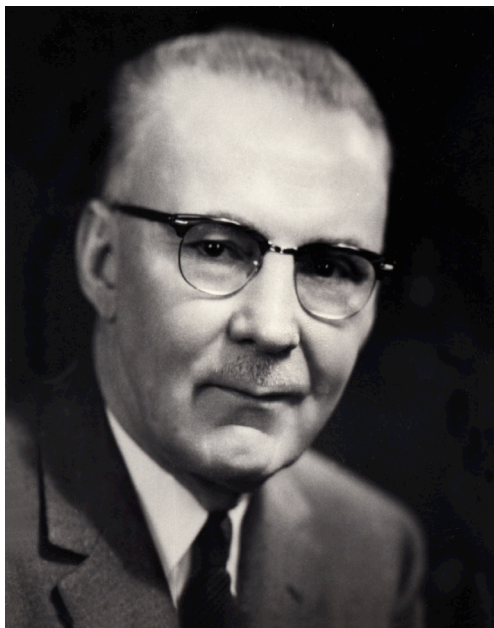
Dr. J. LeRoy Kimball, date unknown. In 1962, Kimball founded Nauvoo Restoration Incorporated (NRI) and served as president from 1962–1987.

These purchases paved the way for significant expansion of the LDS Church presence in Nauvoo during the 1960s. The actions were highlighted by a decision