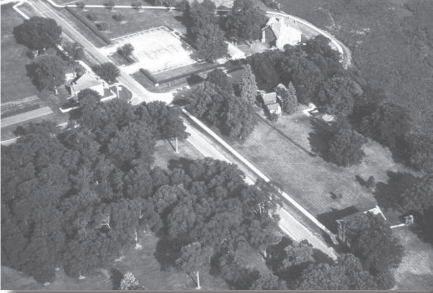
Aerial view of the original Joseph Smith properties currently owned by the Community of Christ, including the Mansion House, Riverside Mansion (formerly the Nauvoo House), Homestead, and the Red Brick Store, ca. 1985.