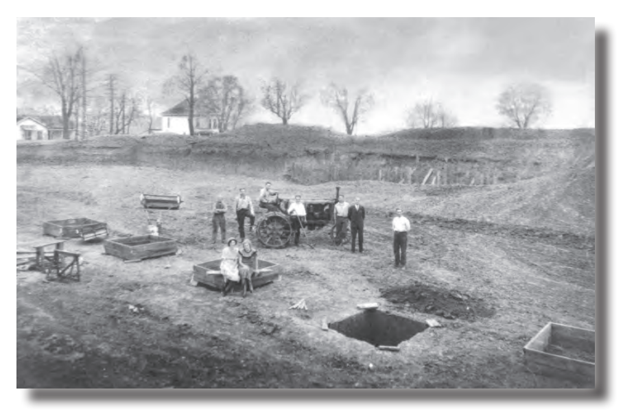
Photograph 23. View to the southeast showing the temple lot excavation, 1933.