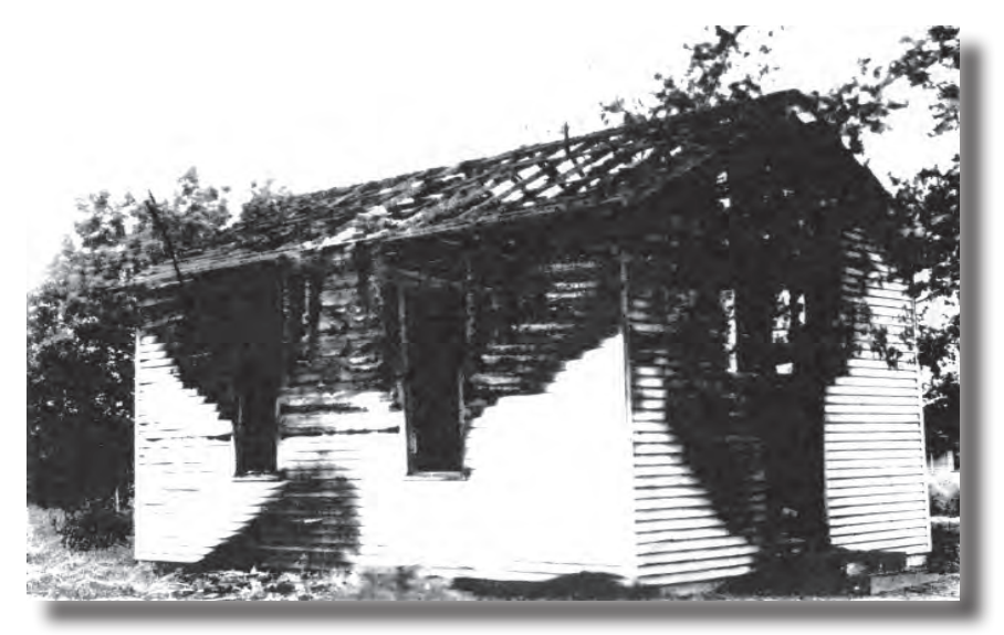
Photograph 6. Church of Christ (Temple Lot) 1889 meetinghouse (south and east sides) shortly after the September 4, 1898, fire.