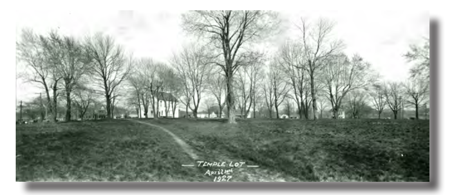
Photograph 14. Panoramic view of the temple lot to the northeast, April 30, 1927.