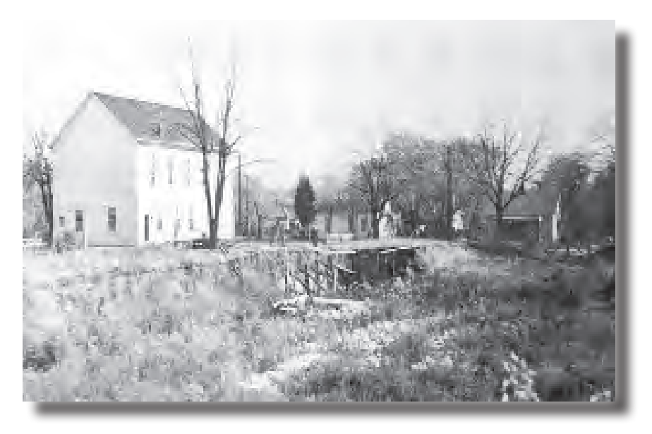
Photograph 24. View to the east showing the Church of Christ (Temple Lot) excavation, ca. late 1930s or early 1940s.