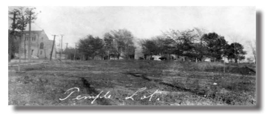
Photograph 8. View of the temple lot to the east, ca. 1904.

This view of the temple lot is to the east. Lexington Street and the RLDS Stone Church can be easily seen in the left of the photo. The west side of the Church of Christ (Temple Lot) can be seen through the trees, along with cattle grazing in the fenced portion of the property. The west end of the property shown in the foreground indicates that this portion of the temple property had not been maintained as well as the fenced portion of the site.