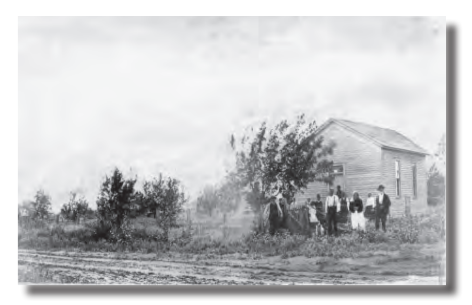
Photograph 1. Church of Christ (Temple Lot) 1889 meetinghouse, east side, ca. 1890s.

In 1887, after twenty years of discussing the matter of building a meetinghouse or small chapel on their property, members of the Church of Christ (Temple Lot) finally moved ahead with their plan. During the April 6 session of conference, the members agreed "that a committee of three be appointed to superintend the building of a house of worship and to locate the same on