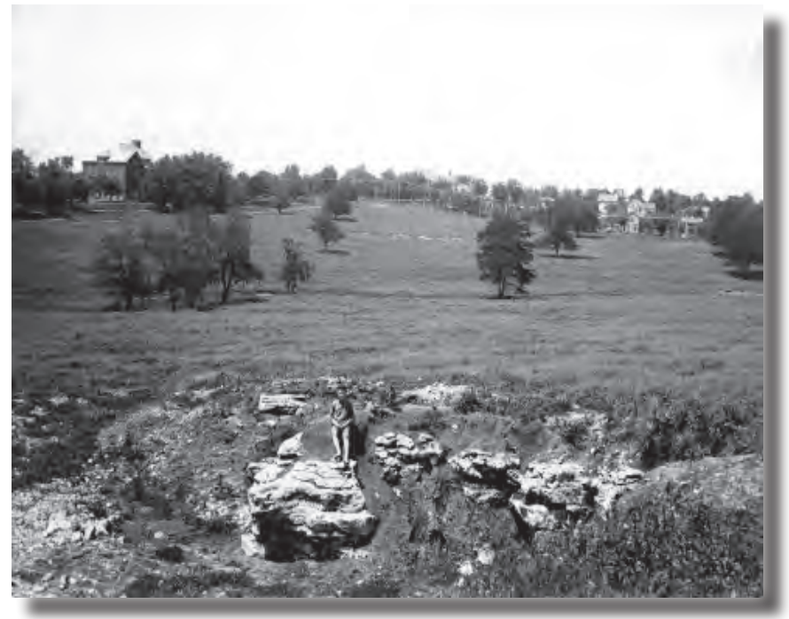
Photograph 11. View of the temple site to the north-northeast, ca. 1910.

Between 1900 and 1917 the Church of Christ (Temple Lot) experienced some growth in membership and dealt with internal dissent, but stalemated in its attempts to improve relationships with the Reorganized Church of Jesus Christ of Latter Day Saints. This photo of the temple site was taken about