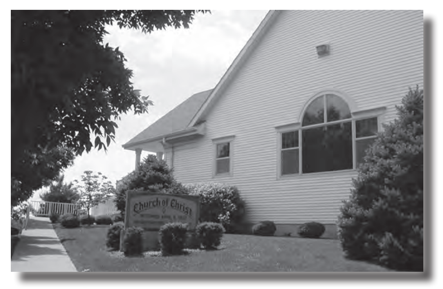
Photograph 31. View of the Church of Christ (Temple Lot) 1992 meetinghouse, east side, May 16, 2002.