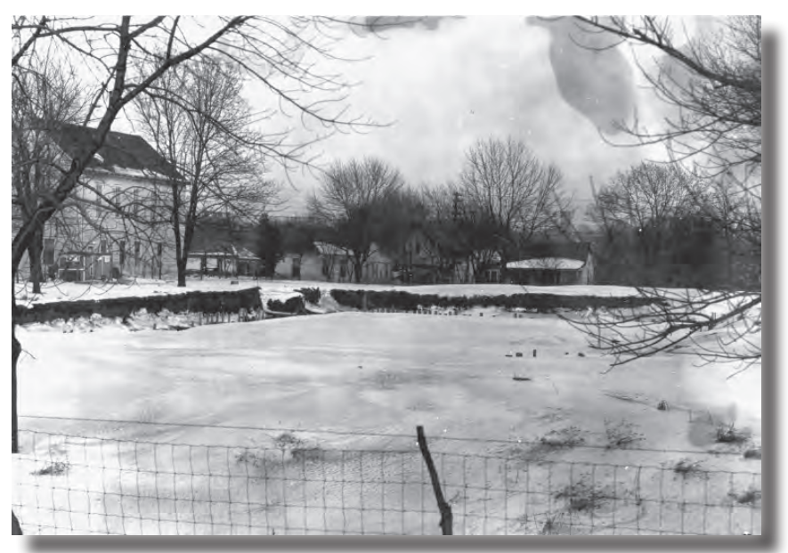
Photograph 22. View to the east showing the Church of Christ (Temple Lot) temple excavation, ca. 1929–1930.

Christ (Temple Lot) officials maintain that both the surveyor's stone and the southeast marker stone are genuine.<sup>39</sup> Both stones are prominently displayed in the Church of Christ's (Temple Lot) visitors' center located in the basement of the Independence meetinghouse. In addition, cement markers have also been placed on the temple lot to identify the locations where the stones were discovered.