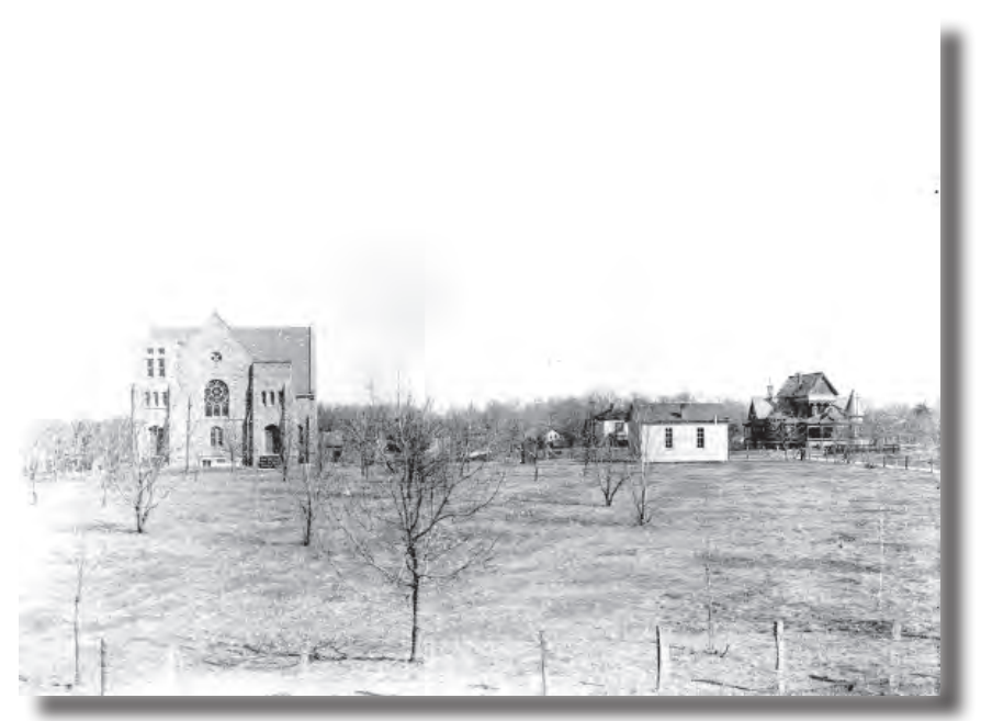
Photograph 3. View of the temple lot to the north showing the Church of Christ (Temple Lot) 1889 meetinghouse and the RLDS Stone Church, ca. 1890s.

This photograph of the temple lot shows almost the entire view of the two and one-half acres owned by the Church of Christ (Temple Lot). The view is to the north and clearly shows the 1889 Church of Christ (Temple Lot) meetinghouse and the RLDS Stone Church completed in 1892. Immediately behind and to the left of the Church of Christ meetinghouse is the home of C. A. Bishop. The large home shown to the right was owned by George Bartholomew. The photo was taken in the winter or early spring of the year, as evidenced by the fact that the trees are bare. One can see in the photograph the efforts made to beautify the temple lot property. When Joseph Smith Jr. dedicated the temple lot in August 1831, the property was heavily treed. In the intervening years following the expulsion of the Saints in 1833, the trees were cut down by local residents for their timber value.<sup>16</sup> The trees seen on the grounds were planted in 1883.<sup>17</sup>