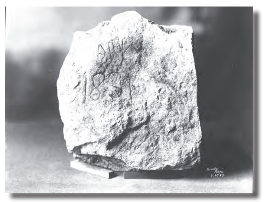
Photograph 19. Purported to be the northeast cornerstone temple marker, Grinter photograph, June 24, 1929. The inscription is believed to be a surveyor's marker indicating that the stone was placed forty feet west of the northeast cornerstone.