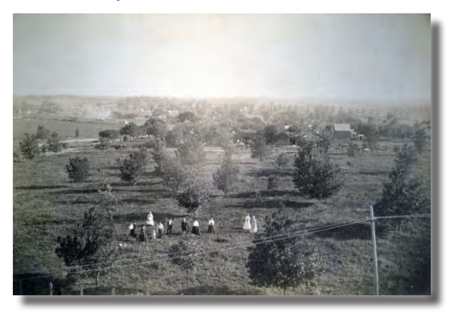
Photograph 4. View of the temple lot to the south, probably taken from a window in the RLDS Stone Church, ca. 1890s.

This photograph shows a view of the temple lot property to the south. The elevated position suggests the photo was probably taken from an upper-story window, or one of the towers of the RLDS Stone Church located on the north side of Lexington Street. The men, women, and one child (eleven total), possibly RLDS Church members, are posing for the occasion. Note that electrical lines have been put in place and run parallel to Lexington. The blacksmith shop owned by RLDS member James Page is partially visible in the background. The Community of Christ Auditorium now stands on the site where the blacksmith shop is located.