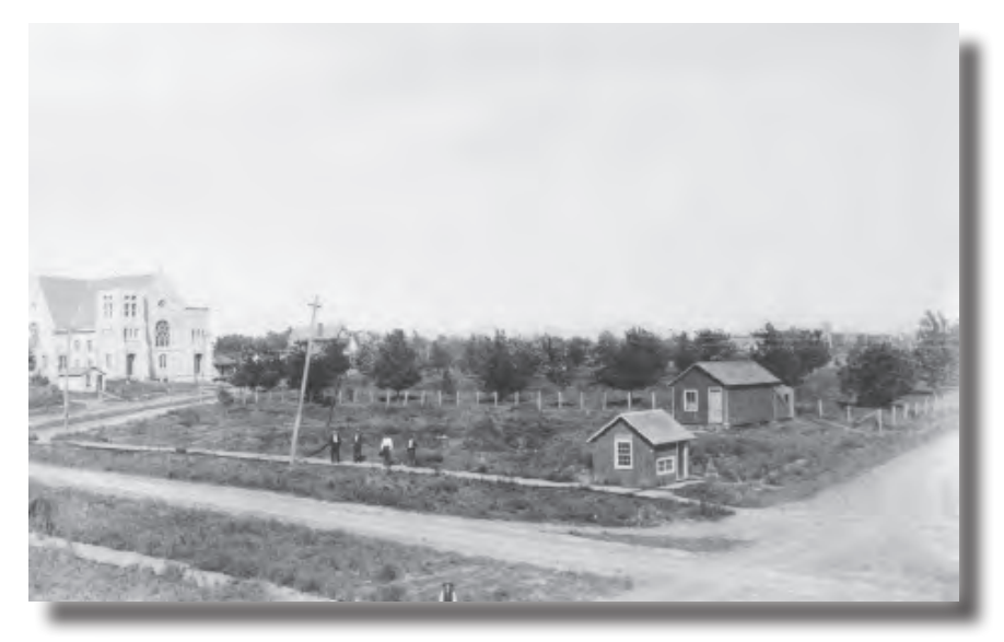
Photograph 12. View of the temple lot to the northeast, early 1900s.

This photograph, taken in the early 1900s, is a view of the temple lot to the northeast and was probably taken from the second story window or roof-top of a two-story commercial building (later called the Star Market) located on the southeast corner of Walnut and Lexington Streets. The four men and the boy in the photograph are likely members of the Church of Christ (Temple Lot). Several features stand out in the photograph. The most noticeable are the two outbuildings constructed on the southwest corner of the temple lot, used as storage sheds for tools and equipment.<sup>24</sup> It is not known when these structures were built or removed. Also noticeable is the dirt road or street that has been cut, running directly north and south (subsequently called "Temple