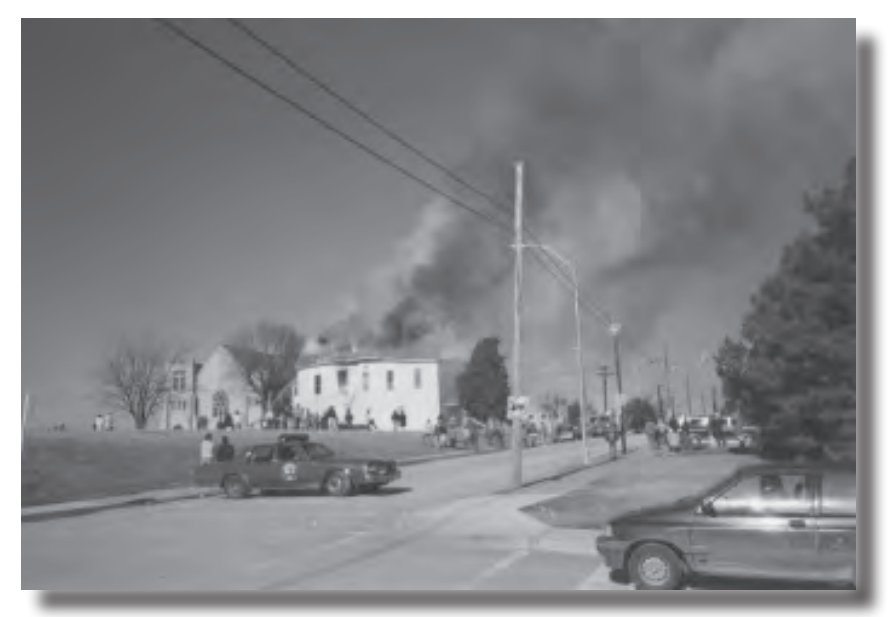
Photograph 30. View to the north showing the Church of Christ (Temple Lot) meetinghouse on fire, January 1, 1990.