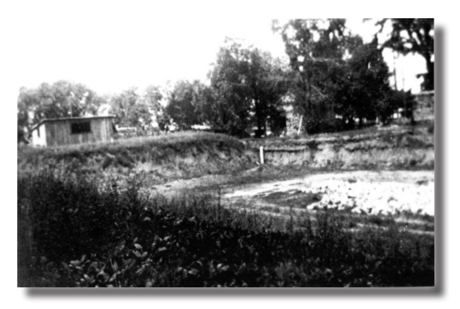
Photograph 25. View to the northwest showing the temple excavation, late 1930s to early 1940s.

Otto Fetting's "Fifth Message" called for the temple on the temple lot to be built in seven years.<sup>44</sup> However, the project never got any further than the excavation. By the late 1930s, the excavation became a property eyesore, full of loose rock, wild grasses, weeds, and rotting wood, as shown in this photograph by the late Wilford C. Wood of Bountiful, Utah.