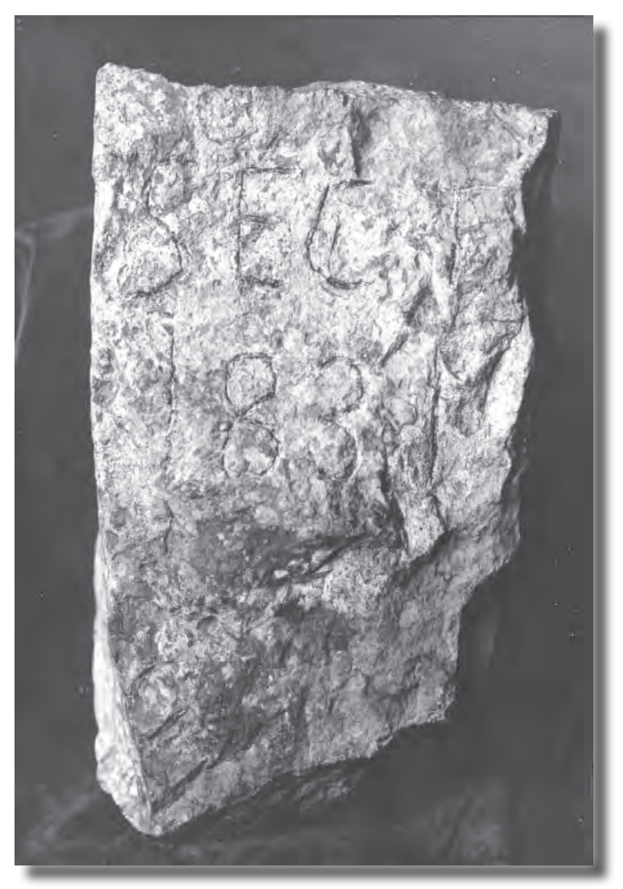
Photograph 21. Southeast cornerstone temple marker, discovered June 26, 1929. The above photograph was taken March 29, 1930. Church of Christ (Temple Lot) officials believe the inscription "SECT 1831" to stand for "South East Corner Temple 1831."