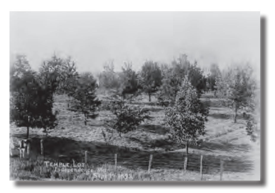
Photograph 5. View of the temple lot to the north-northwest, September 1, 1893.

On September 4, 1898, the meeting house of the Church of Christ (Temple Lot) was set afire by W. D. C. Pattyson, an enemy of the church, who had been released from prison only two days before for having previously set on fire the fence surrounding the property. Later that day he "turned himself in" to the local jailer.<sup>18</sup> The loss of the little church was a tremendous blow to the members, who were still recovering from the financial difficulties caused by the "Temple Lot Case."<sup>19</sup> The photo shows that the fire was extinguished before it consumed the entire building. However, because of the extensive damage, the decision was made to raze the building. The building had stood for approximately nine years (1889–98).