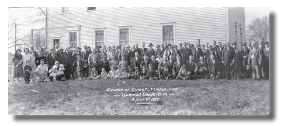
Photograph 13. Members of the Church of Christ (Temple Lot) assembled on the south side of the 1902 meetinghouse, as part of the April 6, 1927, general conference.

The April 1927 conference of the Church of Christ (Temple Lot) was "abuzz" with the announcement that Otto Fetting, one of the recently ordained apostles, had received revelations or "messages" (from a divine being who identified himself as John the Baptist) regarding the fulfillment of Malachi's prophesy (Malachi 3:1), and that the building of the "long-awaited" temple was to soon commence.<sup>28</sup> This group photo, while only a portion of the total membership of the church, is representative of the significant growth experienced by the Church of Christ during the period 1918–29. The growth was primarily the direct result of "transfers" from the RLDS church, a practice that was permitted at this time in accordance with the "Agreements of Working Harmony."<sup>29</sup> Before 1918, the Church of Christ (Temple Lot) membership was estimated at two hundred.<sup>30</sup> However, between 1918–29, it is estimated