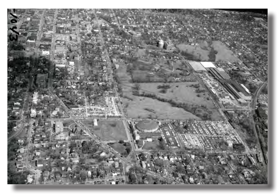
Photograph 26. Aerial view to the east showing the temple lot (including the filled-in excavation) and the surrounding RLDS (Community of Christ) and LDS properties, ca. 1950s.