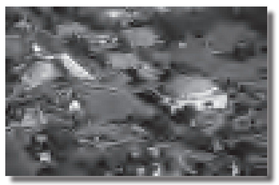
Photograph 32. Aerial view to the east-southeast showing the Church of Christ (Temple Lot) 1992 meetinghouse and surrounding properties, 2001.