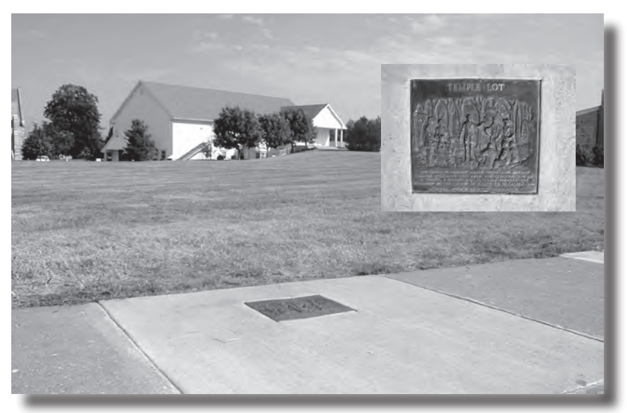
Photograph 33 and inset. View to the north showing the Church of Christ (Temple Lot) 1992 meetinghouse and the in-ground marker placed by the Missouri Mormon Frontier Foundation (May 25, 2000) situated on the south sidewalk of the temple lot, 2000.