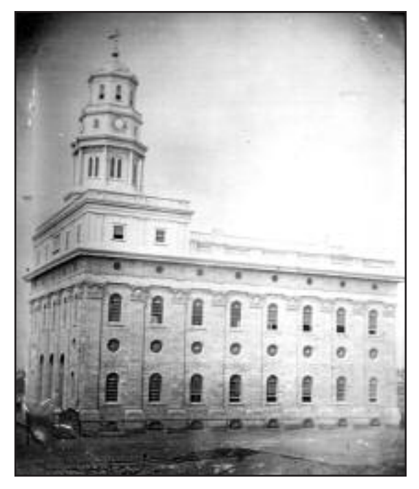
Chaffin Daguerreotpye, 1846.

and interior designs for the reconstruction of the Nauvoo Temple. Architect Gerald P. Maxwell. Historic Restoration Researcher on the project, has concluded that two primary sources of information were of utmost importance-the Chaffin daguerreotype of the Nauvoo Temple (a small photograph reproduction only 2 1/2 inches by 3 inches in size) found in 1998 in Cedar City, and the original 1840s drawings of architect William Weeks.<sup>37</sup> Maxwell further noted, "The building had not stood for