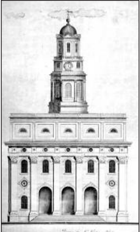
Street of At Rig and William Weeks' drawing of the

The persecution plaguing the Church made it necessary to accelerate work on the temple. Realizing that their forced departure from Nauvoo was