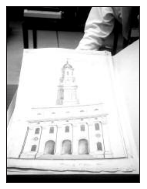
William Weeks' original drawing of front entrance of the Nauvoo Temple. Photograph by Marjorie H. Bennion

have been of inestimable value in showing very precisely a great many of the detail features of the Temple. . . . [His] front elevation was especially rich in showing virtually all features of the west front of the Temple."39 Maxwell noted Weeks' extensive details were used in recreating the massive tower, cornices, moldings, wainscoting, pilasters, windows, columns, framework, portico piers, doorways, roof trusses and roof promenade, and in verifying stone wall dimensions; with his drawing of the Venetian window becoming the centerpiece of the new east wall.<sup>40</sup> Finally, Maxwell noted that, "The most beautiful interior feature in the old, and now in the new Temple, was the winding spiral staircase that