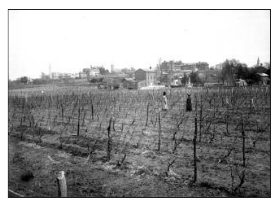
Nauvoo from the flats, May 1907.