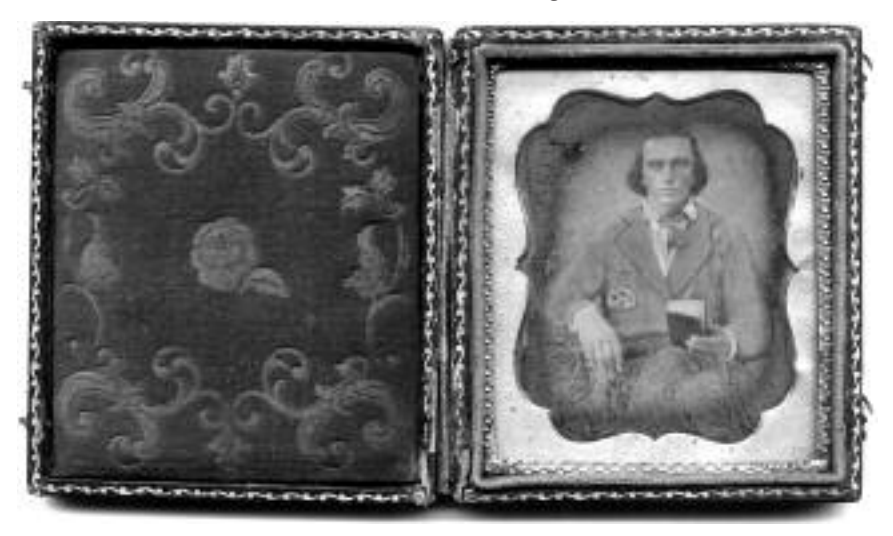
Case containing the Frederick Granger Williams Smith daguerreotype, ca. late 1850s, in the possession of Robert D. Talbot.

I unwrapped the foil to discover a beautiful, acorn-pattern, tooled leather box. I proceeded to open the two small latch hooks and was fascinated by the photo that was contained inside. The image was on a polished, silver-finished copper plate. It looked very old, but it was quite well preserved. Some tarnish had occurred around the outside of the subject. I had to tilt the picture to get a clear view of the subject. The photo was encased in a thin, decorative brass frame covered with glass.