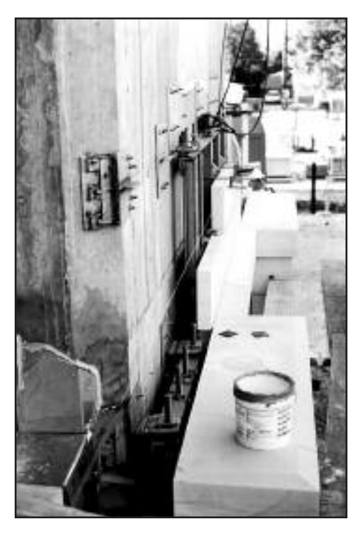
Photograph showing the limestone "veneer" panels being attached to the steel frame, August 2001. The finished stone sections were first attached to steel frames, then the frames were attached in sections to the concrete shell.

A guiding principle for our work was simply, "What would they have done?" That is, if the Saints who built the original building had built the building we were building, with all the interior rooms in this configuration, what would they have done? How would they have trimmed the doors, windows. wall base, and paneling? With all this background information, we set out a sequence of moldings that graduated from room to room. We studied the door and window trim to make sure they were deep enough to receive the ever-increasing