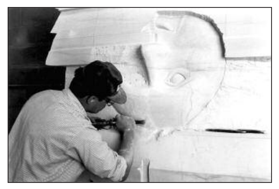
Worker at the Rainier Davido factory in New Castle, Pennsylvania, carving one of the thirty sunstones for the new Nauvoo Temple, August 2000.

wearing some lightweight hiking boots, khaki pants, a sweater over a longsleeved shirt, a fleece-lined parka with a hood, polarized sunglasses, and heavy ski gloves. I was freezing! The radio had reported that the weather was about 10 degrees Fahrenheit, and the wind was blowing strong. It was very cold, and I was grumbling about this little trek I had talked myself into doing. As I walked along the road and read the words of the pioneers who had walked that trail long ago in the same kind of weather, I could not help but think about their sufferings. I was not pulling a handcart or carrying a baby, nor was I wrapped in a hand-knit shawl. I was not hungry or wearing handmade shoes, and I was not leaving my home and the temple that I had probably helped to build. I came to realize how truly blessed I am and how much of a whiner I can be. I learned a little bit about the early Saints' struggles that I probably had taken for granted.