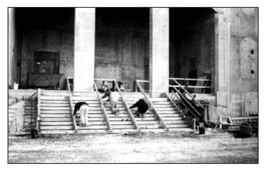
Workers preparing to pour the concrete for the front steps, February 2001.