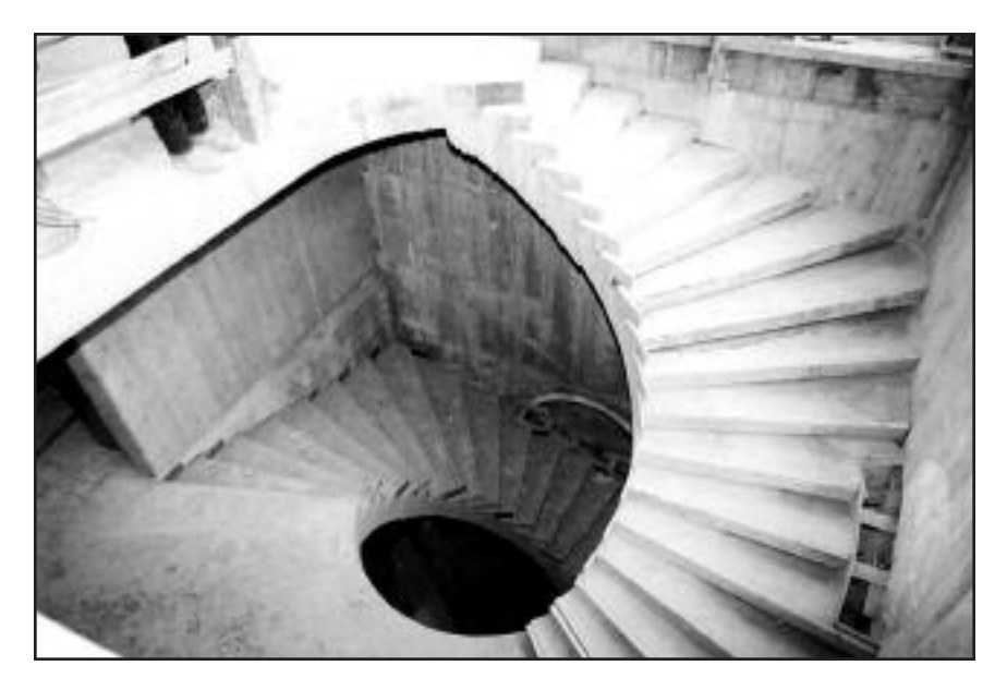
Circular staircase under construction in the southwest corner of the building, July 2001.

Schlair and Jim McElvain from the office of Harry Wesse Architect in Chicago, Illinois, went through the pile and scrounged around town to catalog and document all the existing stone they could. They carefully measured each stone they could find, noting the shape, surface textures, and dimensions of each. This work was compared with the preliminary drawings we were preparing and was integrated with what we knew so that the stone drawings could be as accurate as possible. We found representative samples of the more typical stones, but there were not enough of the unique stones (outside corners, base and water table stones, and arch stones) to feel confident about having everything exactly right.