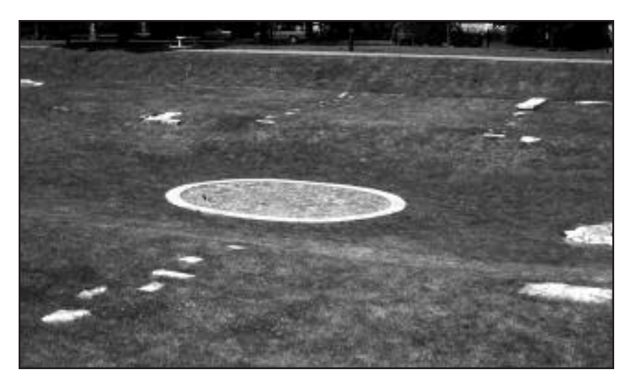
Bricked area showing the location of the Nauvoo Temple baptistry, 1998.