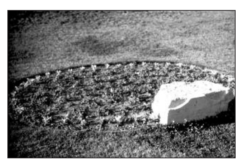
Location of the Nauvoo Temple baptismal font and a remnant from the stone baptistry, June 1979. On 8 November 1841, a wooden font, carved by Elijah Fordham, was put into place in the basement area of the temple and dedicated by Joseph Smith. The wooden font was used from November 1841 until it was replaced with a stone font in August or September 1845.