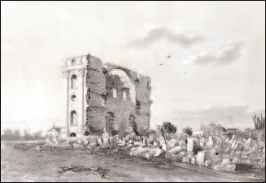
Ruins of the Nauvoo Temple from Route from Liverpool to Great Salt Lake Valley by Frederick Piercy.

no trace of the temple remained, except its well, on the temple block.