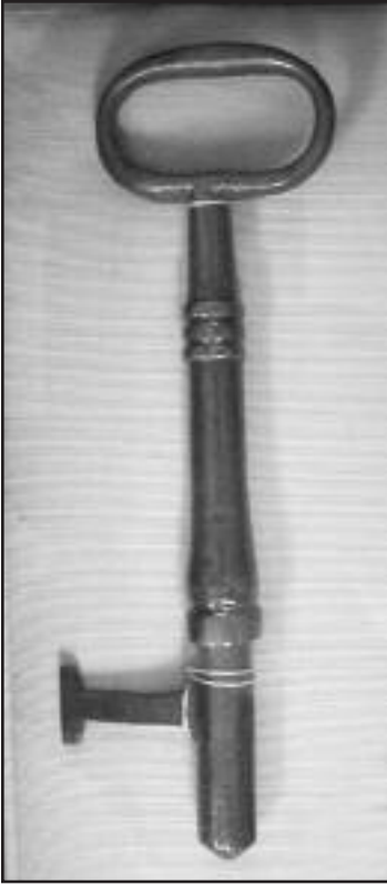
Closeup of one of the Nauvoo Temple keys in the possession of the Historical Society of Quincy and Adams County, Quincy, Illinois, December 2001. The Society loaned the key shown above to the LDS Church so that reproductions of the key could be made for commemorative use by the Church.