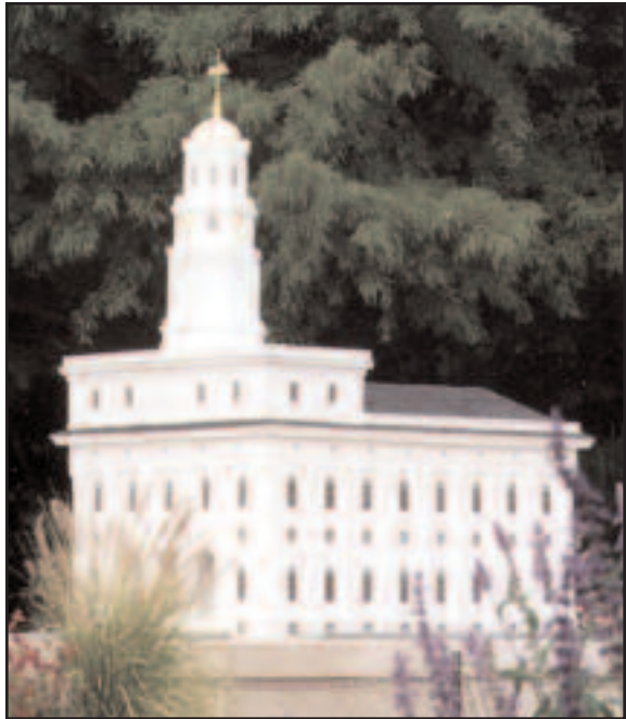
Replica of the Original Nauvoo Temple, Nauvoo, Illinois.