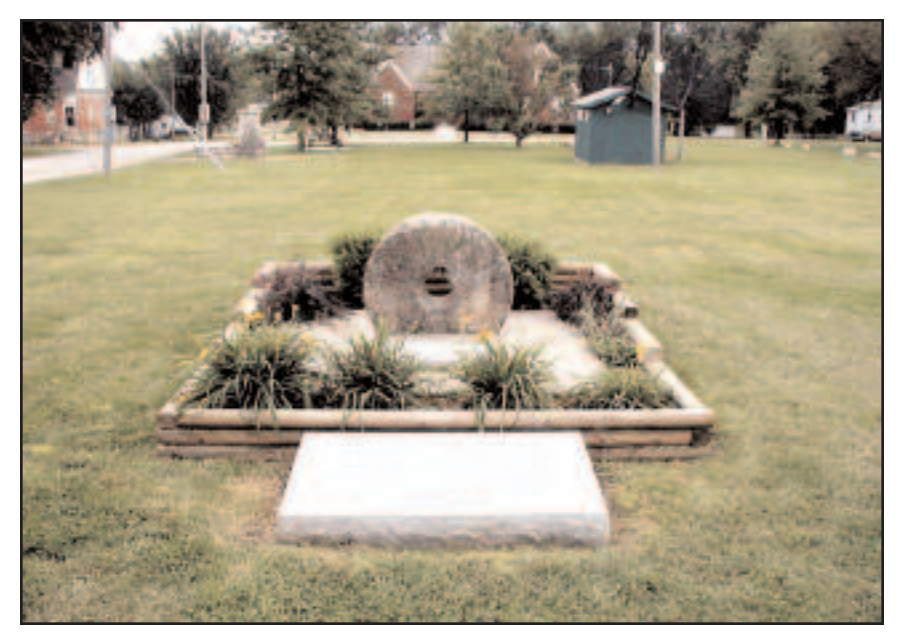
Haun's mill stone and marker in the Breckenridge City Park, 22 September 2001