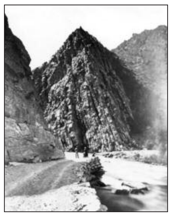
Ogden Canyon Road looking west, c. 1870.

ern and southern ends presented the least impediment to travel, but crossing them took the traveler to Cache and Morgan valleys, respectively. This was of little help, as most of the settlers' business lay to the west or southwest, on the other side of the rugged mountains forming the Wasatch Front, in the valley of the Great Salt Lake. Two routes west through these mountains were available: Ogden Canyon, which was so narrow at its western end to be "almost impassable," and North Ogden Pass, whose summit lay some thousand feet above the valley floor.<sup>13</sup> Despite the steep climb and dizzying