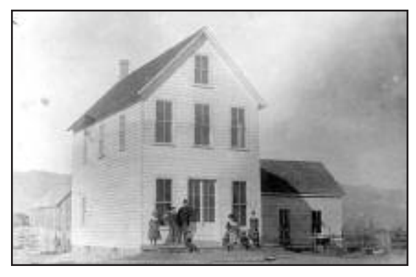
James C. Wangsgaard's "White Store," 1887. The Wangsgaard family lived in the wing on the right. The lower level was the store, while the second story was used for dances and socials. The store was located where the Huntsville First and Second Ward meeting house is today.

Preliminary research has shown that in their isolated, mountainous situation, the valley's settlers may have been more subject to the depredations of wild animals than many other communities. Most early settlers in Utah suffered losses from wolves, coyotes, and crickets, but sever-