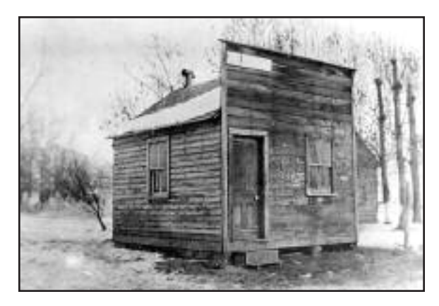
Old Post Office, c. 1900

One can travel the length and breadth of Ogden Valley today in a matter of minutes, and a drive up Ogden Canyon is little more than a Sunday excursion. Insulated, wellheated homes and cars have taken the bite out of the area's winters, and greenhouses and pesticides assure that anyone whose thumb is even moder-