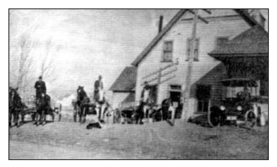
Blackman and Griffin Creamery, c. 1915. This site is now covered by the waters of Pineview Reservoir.

to keep me dry. Wet boards were laid down on my bed for me to lie on. A sheet was hung up to the head of the bed to keep out the wind and one across the foot of the bed. . . . Thus I gave birth to the first white child born in Ogden Valley." ^{66}