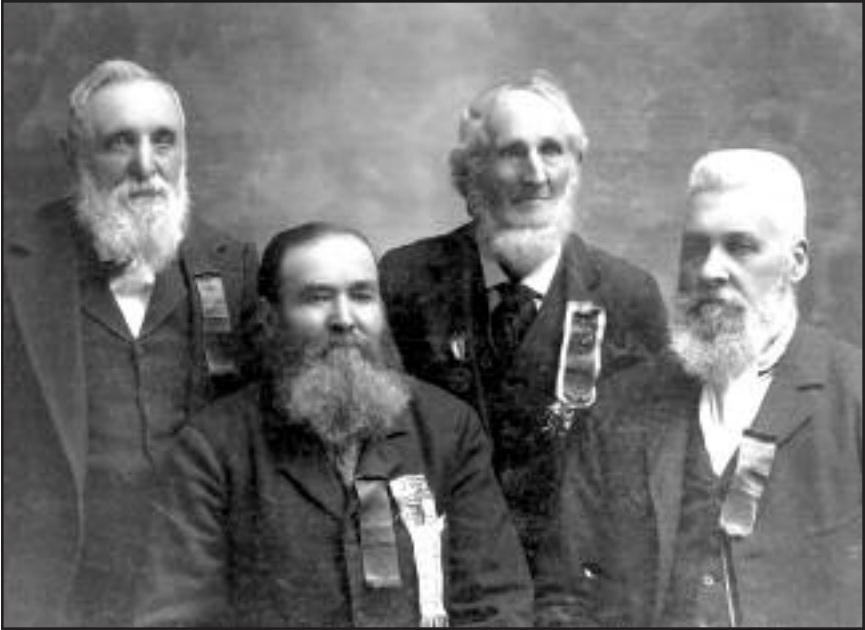
Golden Jubilee Celebration, 1890