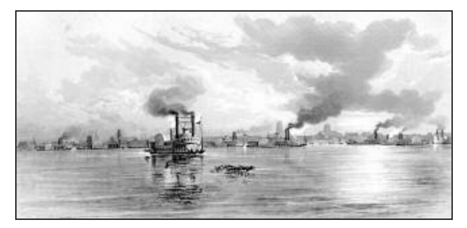
New Orleans, by Frederick Piercy, Route from Liverpool

If he possessed sufficient money to pay his passage upstream, he could immediately tranship himself with his luggage to a river steamboat and continue his journey inland. If he had sufficient funds to pay his passage, he could take a position at New Orleans until such time as he had accumulated sufficient money to defray the cost of transportation upstream. If he landed destitute, there was no alternative, but to look for employment and to trust to charity to support him in the meantime.<sup>52</sup>