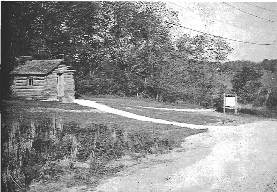
Replica of Galland School