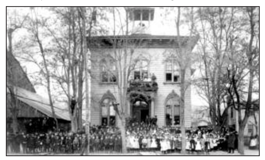
St. Mark's School in Salt Lake City, Utah

land is to be saved . . . to civilization and Christianity, the children must be taught in civilized Christian ways. Remember that, without such teaching and training, the children will of course, accept Mormonism and polygamy." The missionaries went on to say, "We are the only Christian missionaries in the territory. . . . The great feature of the work is in teaching and training children." They then pleaded for $15,000 to build a schoolhouse, even before they asked for contributions to build a chapel.<sup>25</sup>