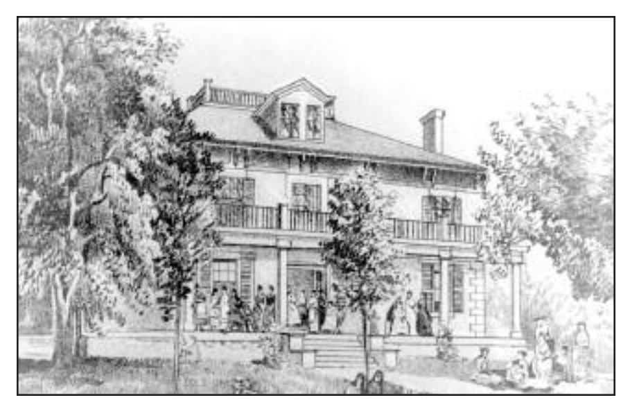
Rowland Hall, Salt Lake City, Utah

high regard that they motivated the leaders of the LDS Church to improve the quality of their own school system. Soon after the Episcopal Church founded St. Mark's School, the Deseret News asserted that the time had now come "for greater attention to be paid to scholastic education. The circumstances of the people are easy. They can spare the labor of their young people, . . . and they can also afford to pay school charges."<sup>32</sup>