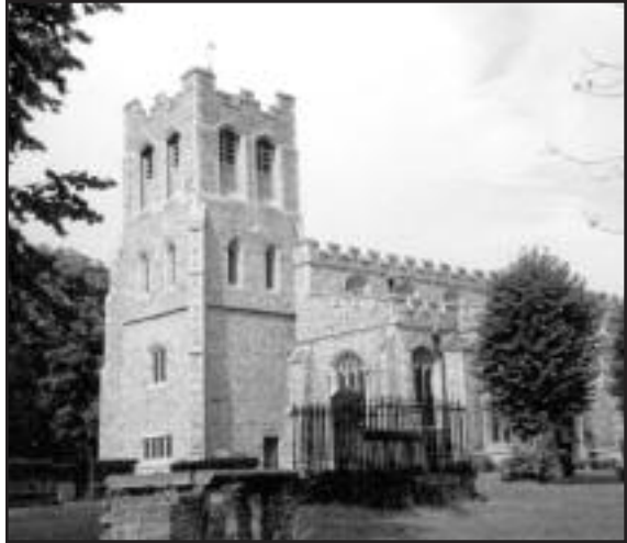
St Peter-ad-Vincula, Great Coggleshall, England