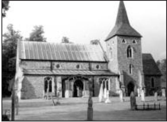
Stisted Parish Church, Stisted, Essex, England