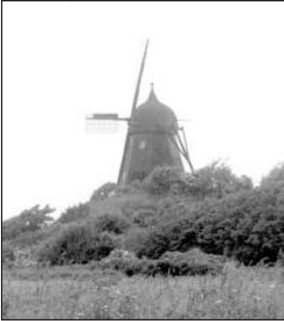
Windmill near Børghum monastery and village, Denmark