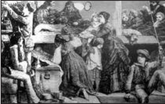
Aboard Emigrant Ship