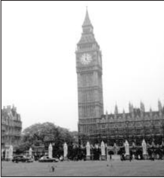
Big Ben, London, England, 1974