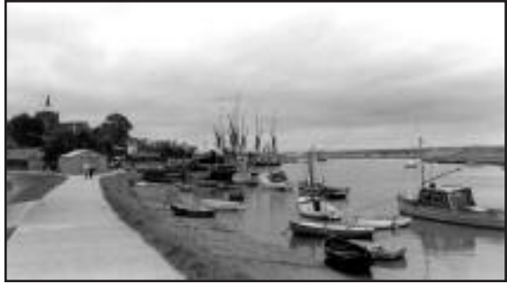
Blackwater Estuary, Maldon, Essex, England, 1974