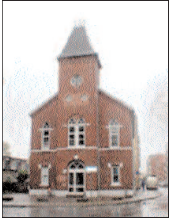
Aalborg LDS Chapel, Denmark