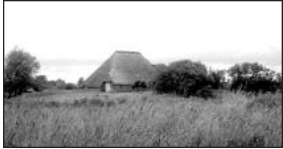
Old Danish home in outdoor museum, Denmark