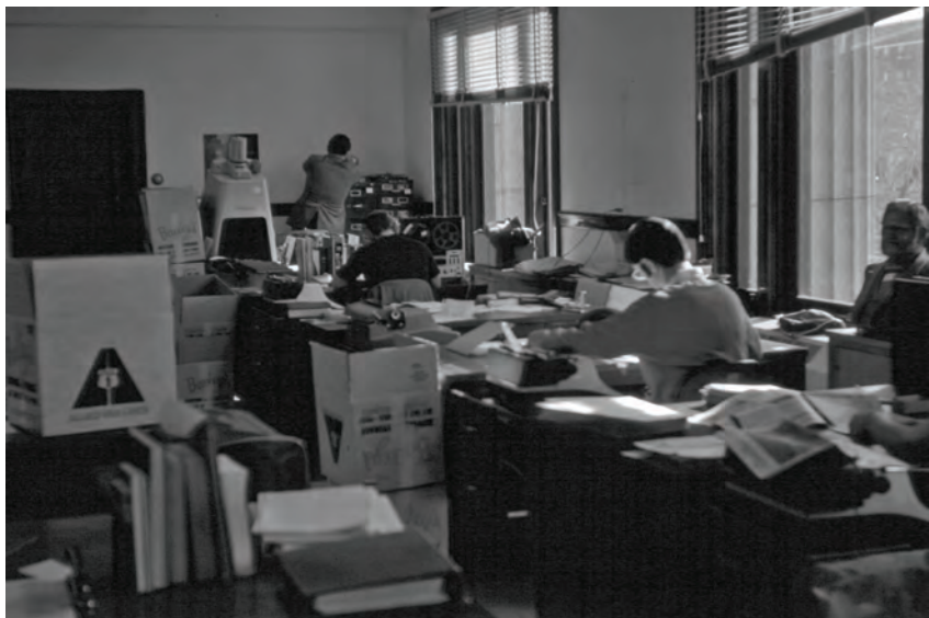
History Division, 47 East South Temple, Salt Lake City, Utah, 1973.