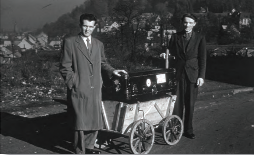
Dean on moving day, Saarbrücken, West German Mission, 1950.

ment restriction, our inadequate language skills, primitive meeting conditions, and disillusionment with religion by many people from war and suffering.