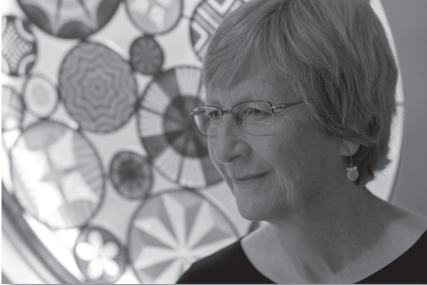
Laurel Thatcher Ulrich, 2009. In 2009, Laurel received the John F. Kennedy Award from the Massachusetts Historical Association. That same year she also served as president of the American History Association.

gives us insights. Let me see if I can think of a really simple example of having to change my belief system because of a confrontation with experience. Certainly having and raising children makes you think very differently about the story of the Fall and the atonement. You think of the paradox of God giving a commandment and having it be part of the plan that Adam and Eve disobey. However, I don't think of God having a pre-established plan that Adam and Eve must disobey; I think about God knowing that this state of immaturity and mortality meant that it was impossible not to disobey because you were immature. And He knew there would be an ability to learn from, grow from, and overcome that. In raising children, you look at that story and you can sort of understand what was really going on there—that life is not about taking a manual and following A, B, C, D, E. Life is about an organic growth from immaturity (from a kind of naïve tell-me-what-to-do stage) to a kind of maturity in which you are constantly facing dilemmas and having to resolve them. The only way you grow is by trying to find your way through impossible dilemmas and problems.