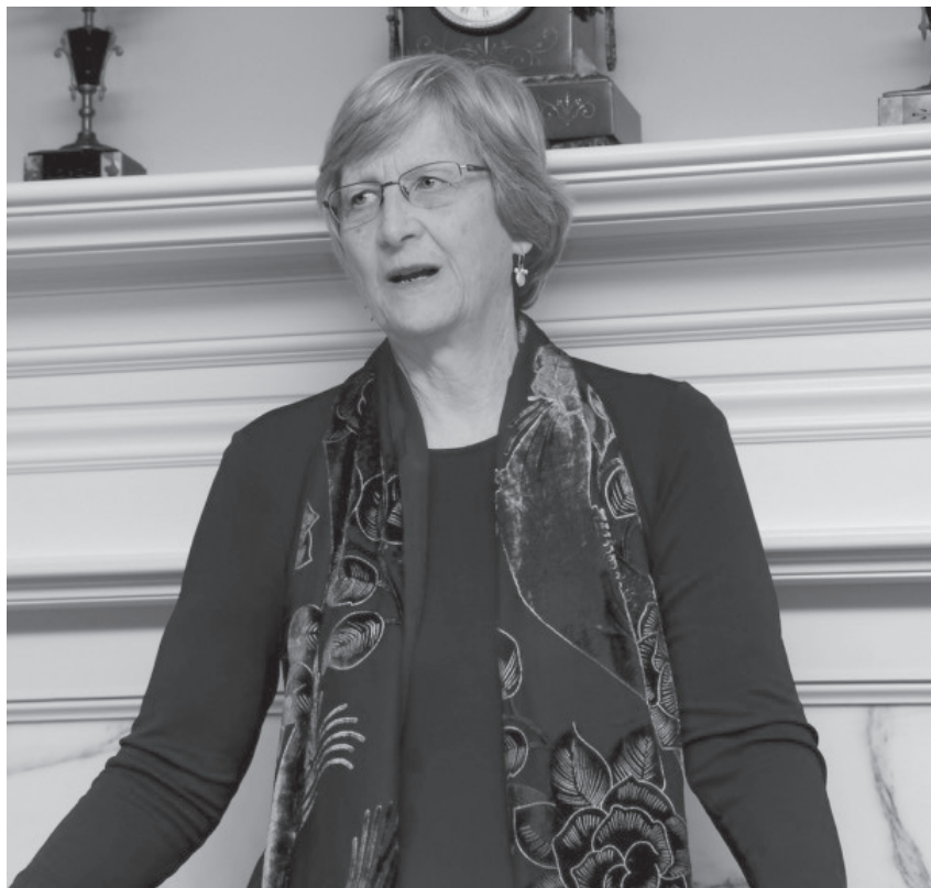
Laurel Thatcher Ulrich, 2012. Photograph by Morris A. Thurston.

“A person who believes in equality between the sexes who recognizes discrimination against women and who is willing to work to overcome it. A Mormon feminist believes that these principles are compatible not only with the gospel of Jesus Christ but with the mission of The Church of Jesus Christ of Latter-day Saints. In 1978 Mormonism and feminism seemed incompatible.”