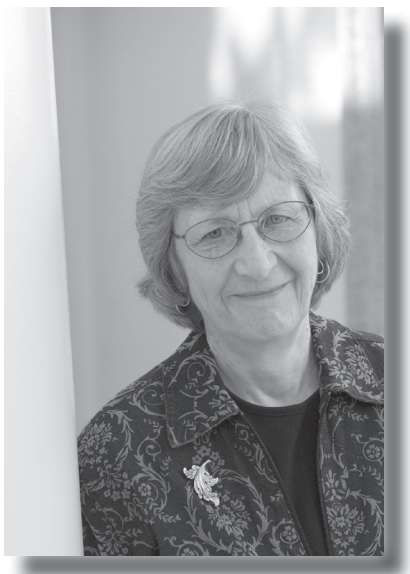
Laurel Thatcher Ulrich, 2006.

LAUREL: When I was a freshman, which was 1956 (two years after Brown v. Board of Education ), my memory is that we talked about the black priesthood issue for months. It may have only been two or three weeks, but we did talk about it. Again, he didn't tell us what to think. We went to the scriptures. The returned missionaries were laying down the law about the blood of Cain or being neutral in the pre-existence or whatever they wanted to do. Then he would go back to first principles and get us thinking. The whole emphasis was on our personal behavior and not on changing the Church. I think it was a landmark experience in my life—an increasingly rare one, I would say.