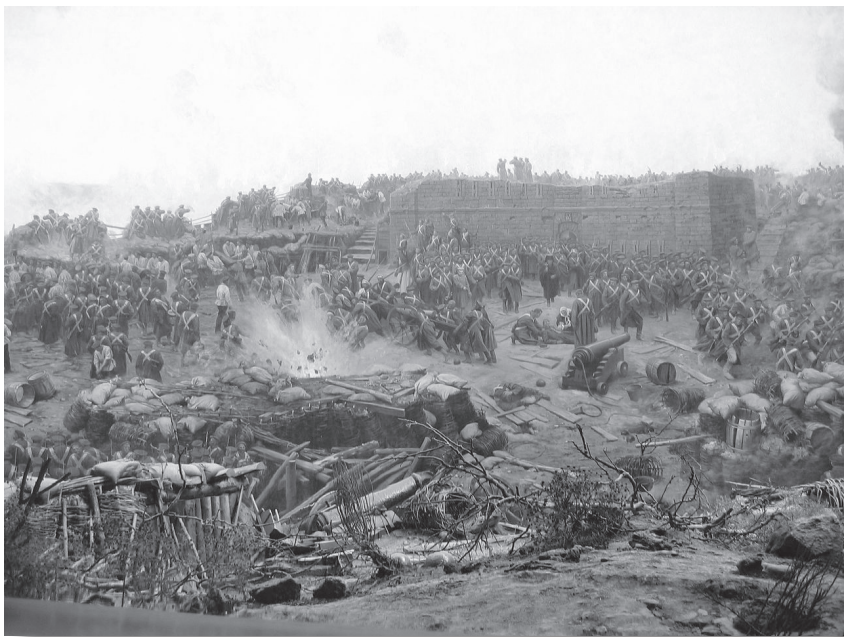
Portion of Franz Roubaud's 1904 panoramic painting of the siege of Sebastopol. Latter-day Saint soldiers from the United Kingdom served in the Crimean War and saw action in the Sebastopol campaign.