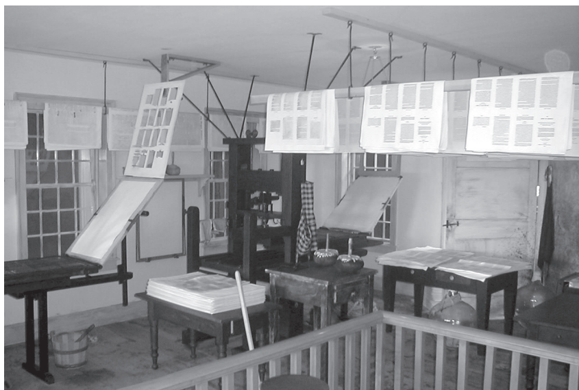
Third floor pressroom, restored Egbert B. Grandin Printing Office, Palmyra, New York, 2001.