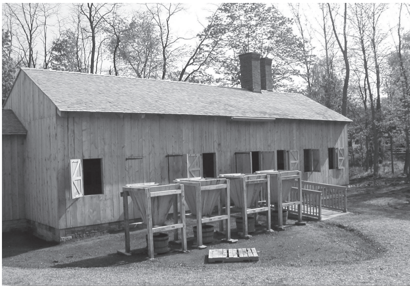
Newel K. Whitney ashery, Kirtland, Ohio, 2003.