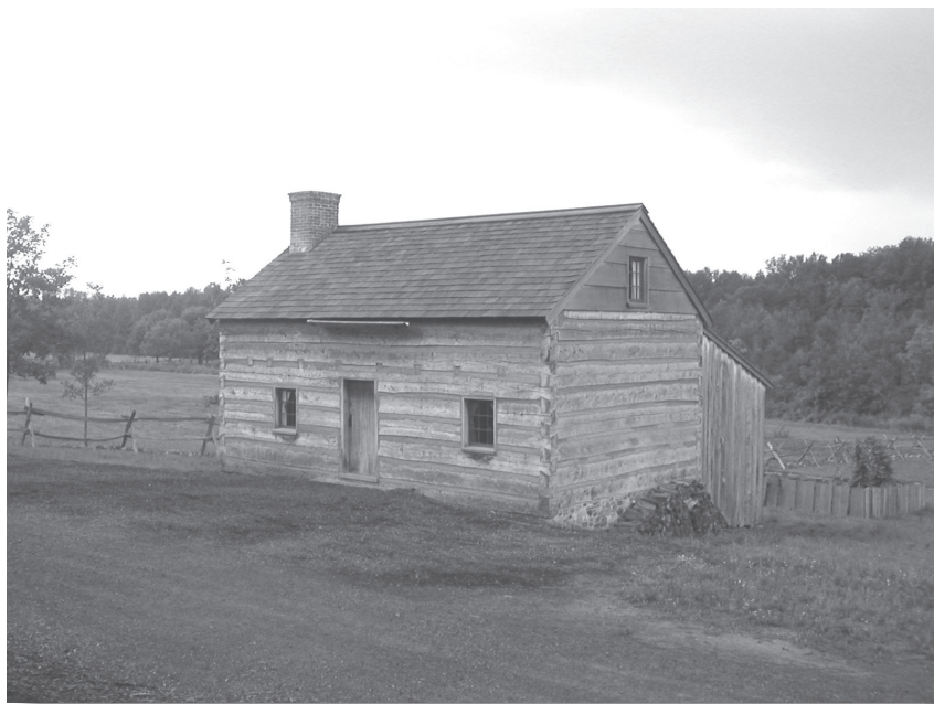
Restored Joseph Smith Sr. log home, Palmyra, New York, 2002.

chains and so many links southeast of the Joseph Smith dwelling house. That gave us the location of one corner of the home. Some infrared aerial photography had been done which suggested this same site would be a good one to look at. The aerial photography indicated thirteen other possible sites, but it turned out the site noted by the surveyors proved to be the only one of significance. It was the only site that had surface artifacts of the historic period, suggesting itself as the site of the Smith log house.