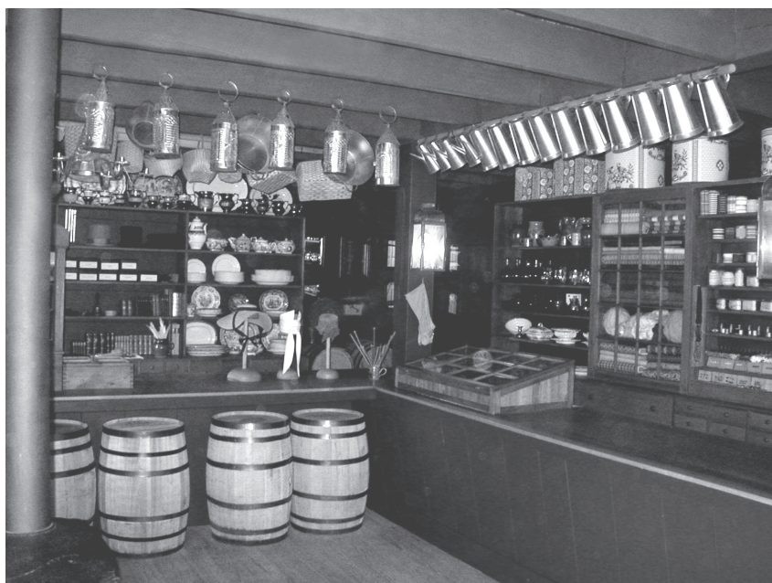
Main storeroom of the restored Newel K. Whitney Store, 2002.