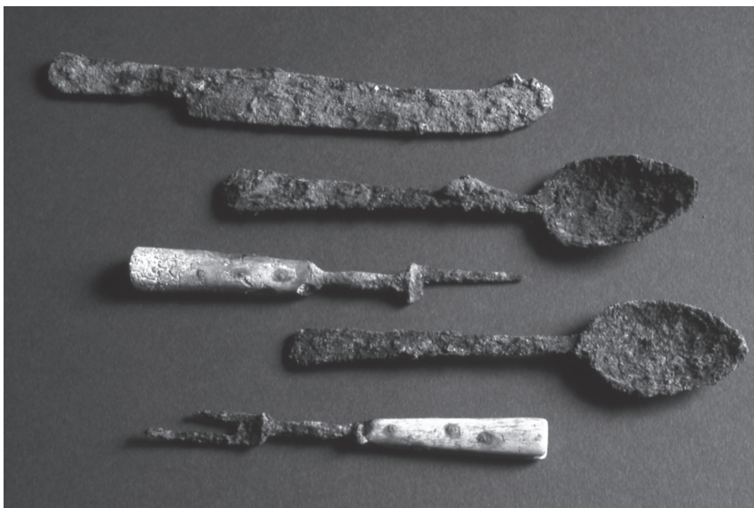
Artifacts from the archaeological dig at the Joseph Smith Sr. log home site, 1982.