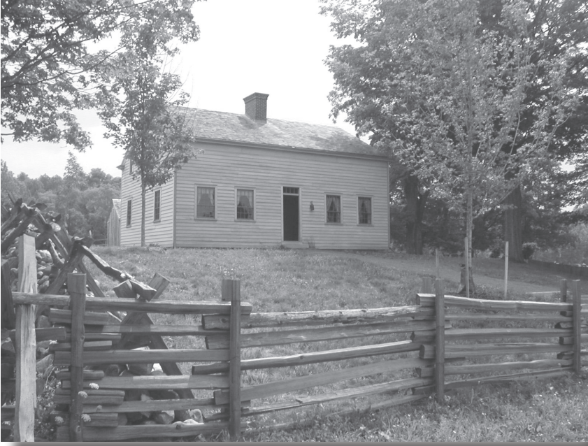
Restored Joseph Smith Sr. frame home, Manchester, New York, 2002.

where those first events occurred. That feeling became strong tradition. Some missionaries who served there were ready to stretch me out by the noose for what we'd done in its restoration. When one reads the documents of the time (the reminiscences of the acquaintances), and visits the home, and studies it carefully, the original structure unfolds to them. It looks and feels right. It is a marvelous restoration.