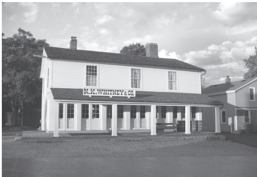
Restored Newel K. Whitney Store, 2007.