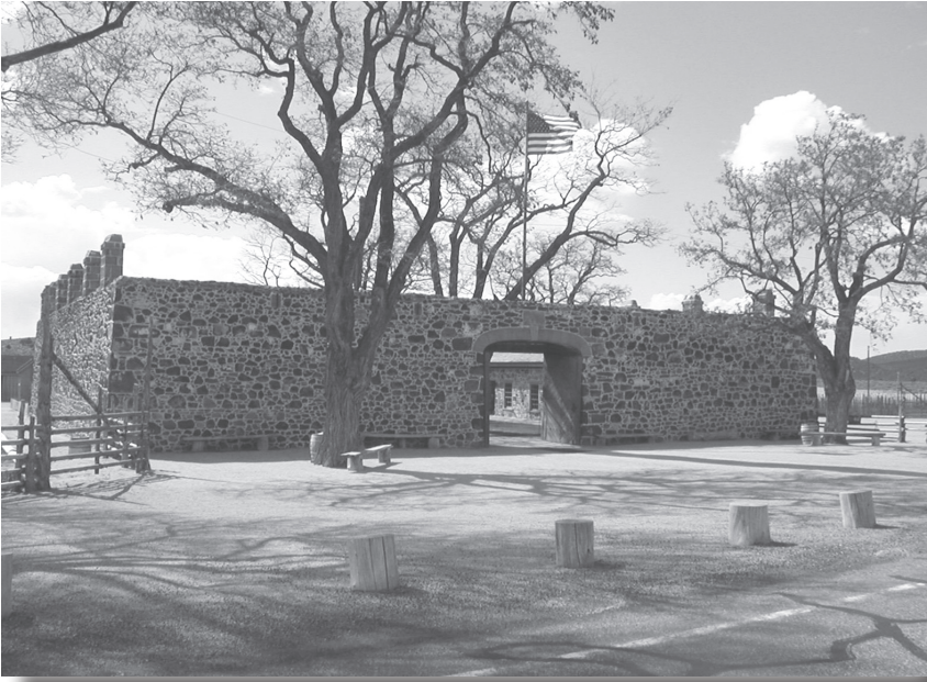
Cove Fort, 2006.

there, but it was long gone. Archeological data defined the length and width of the building. It also indicated the placement of horse stalls and other details.