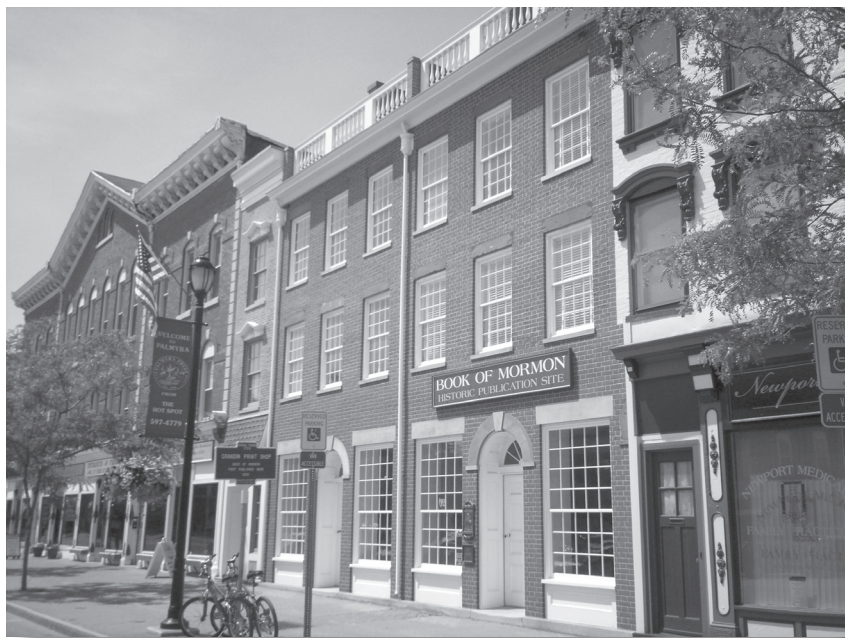
Restored Egbert B. Grandin Printing Office, Palmyra, New York.