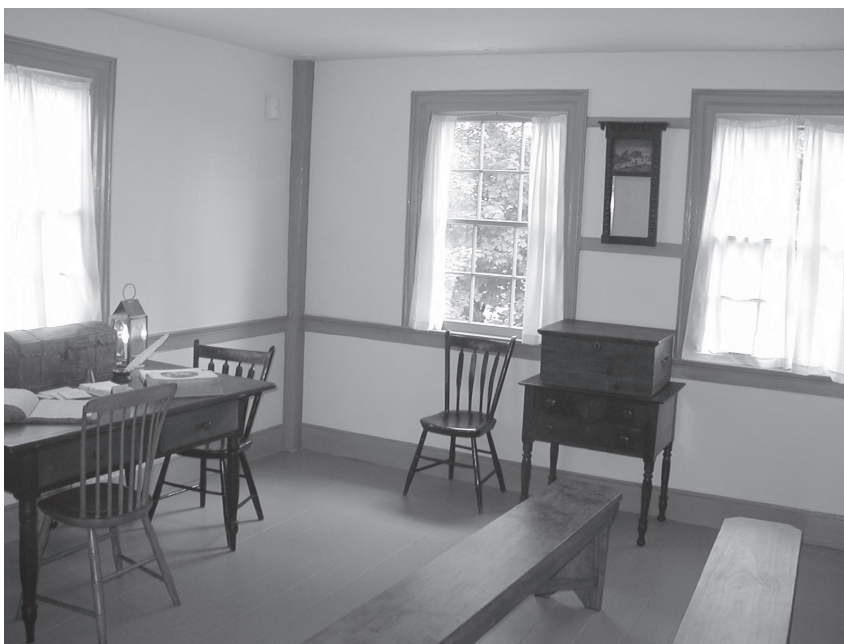
Second floor “translation room” located in the southeast portion of the restored John Johnson home, Hiram, Ohio, 2002.