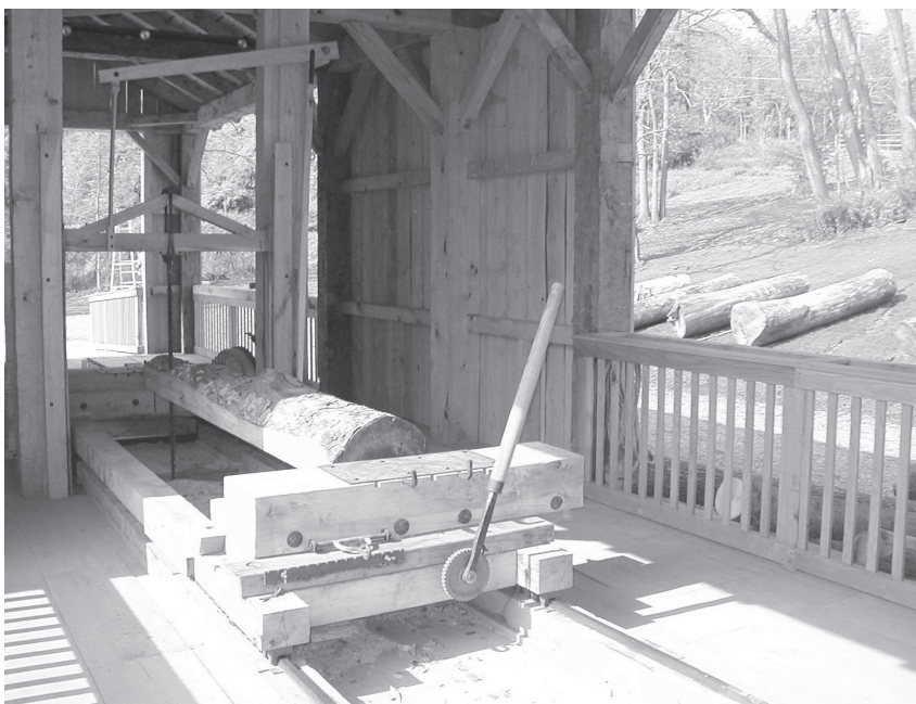
Sawmill operations, Kirtland, Ohio, 2003.