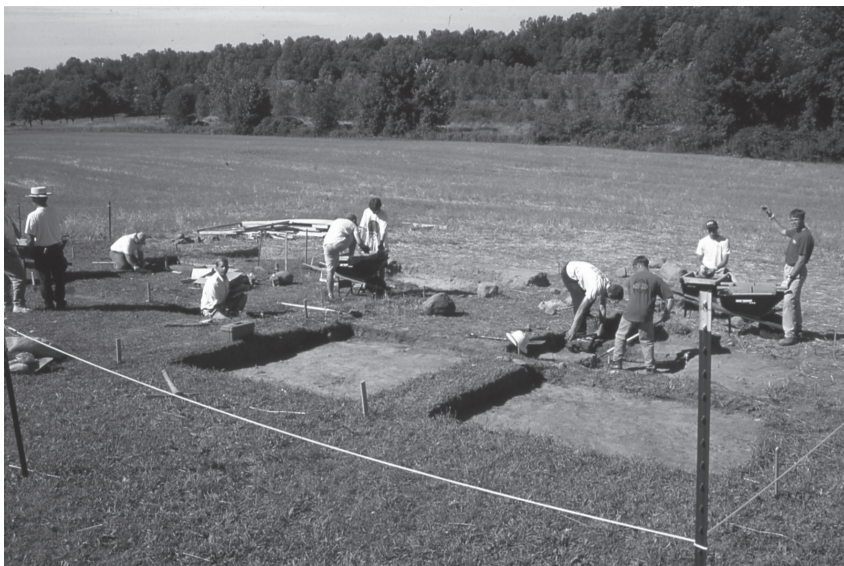
Archaeological dig at the Joseph Smith Sr. log home site, Palmyra, New York, 1982.