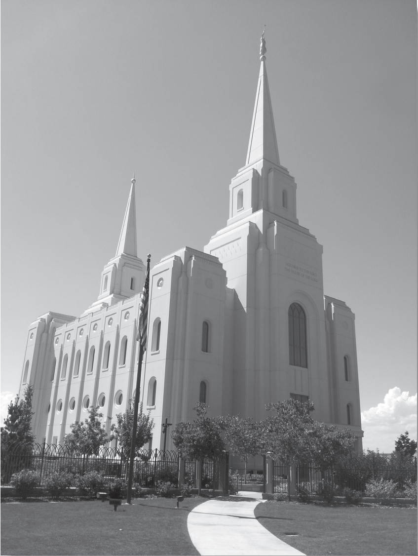
Brigham City Temple, June 2014.