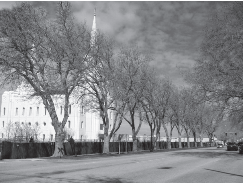
View of the Brigham City Temple, March 2012. Even without foliage, it was evident that the ten sycamore trees would block the east side view of the new temple.

Significantly, President Boyd K. Packer was the object of slander regarding the sale of the property. Several messages on the Internet suggested that he was the owner of the property and that he had made enormous profits from the sale of the land to the Church. He was in fact never involved financially. The rumors may have been based on the surname he shared with