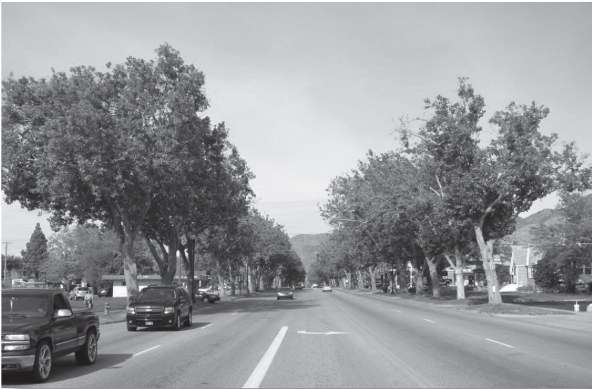
Brigham City's Main Street looking north from 700 South Street, October 2012.