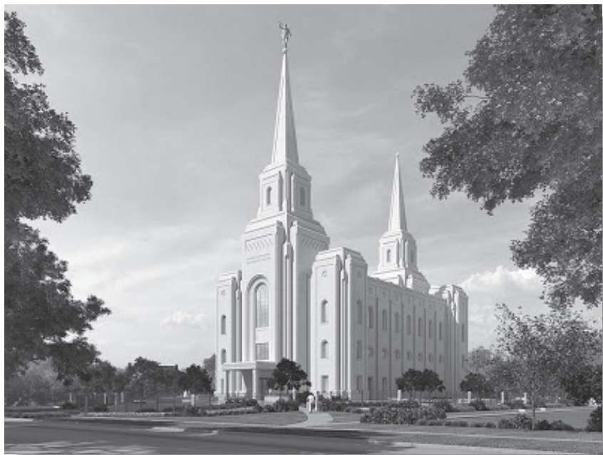
Artist conception of the Brigham City Temple and temple block. Note that none of the then existing sycamore trees are depicted.

in television and newspaper reports of the ensuing weeks. Speculation was rampant among local residents regarding possible building sites for the structure, but that came to an end on October 26 when the Church announced that the empty lot across Main Street from the famous Box Elder Tabernacle (between 200 and 300 South Streets) had been purchased. 4