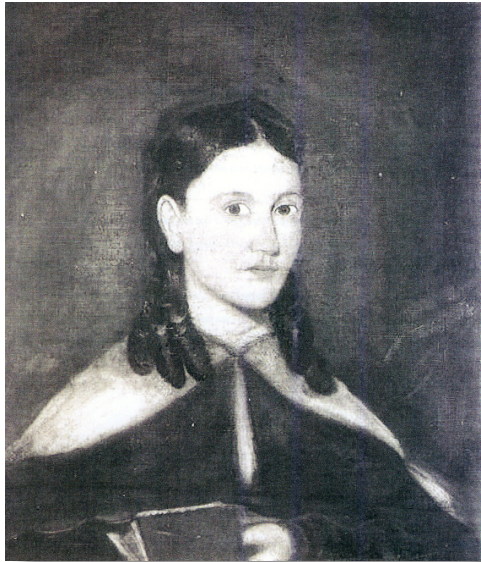
Portrait of Elizabeth Ann Whitmer Cowdery. This painting is believed to have been painted in 1837 as part of a series of portraits of the presidents of the Church and their wives, and was intended to hang in the Kirtland Temple. Oliver Cowdery may have brought the portrait when the family moved from Kirtland to Far West in late 1837. The original painting is housed in the Community of Christ International Museum, Independence, Missouri.