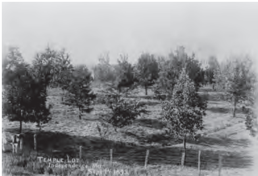
Photograph 5. View of the temple lot to the north-northwest, September 1, 1893.