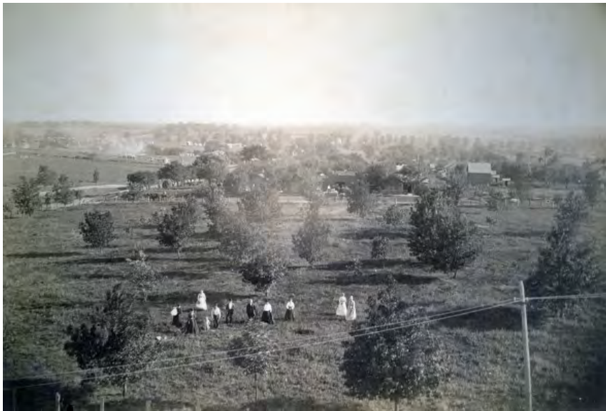
Photograph 4. View of the temple lot to the south, probably taken from a window in the RLDS Stone Church, ca. 1890s.

This photograph shows a view of the temple lot property to the south. The elevated position suggests the photo was probably taken from an upper-story window, or one of the towers of the RLDS Stone Church located on the north side of Lexington Street. The men, women, and one child (eleven total), possibly RLDS Church members, are posing for the occasion. Note that electrical lines have been put in place and run parallel to Lexington. The blacksmith shop owned by RLDS member James Page is partially visible in the background. The Community of Christ Auditorium now stands on the site where the blacksmith shop is located.