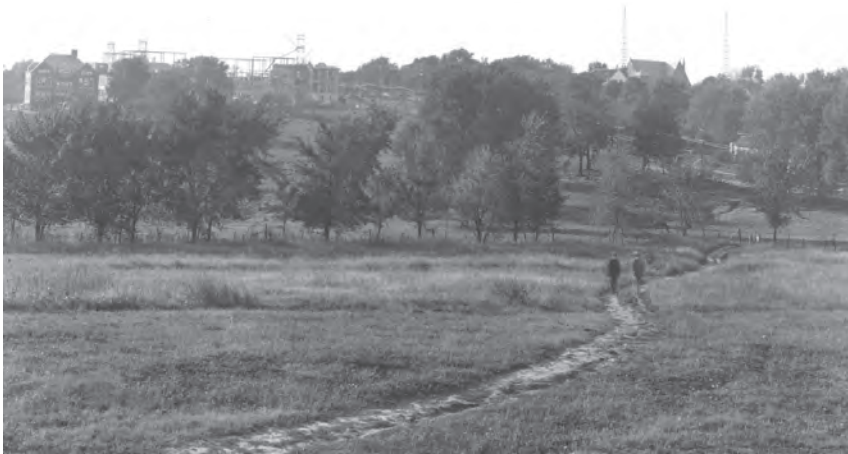
Photograph 15. View of the temple site to the northwest, ca. 1927. The image shows the construction taking place on the RLDS Auditorium. The top of the Church of Christ (Temple Lot) meetinghouse and the RLDS Stone Church can also be seen.

that two to three thousand RLDS members transferred their membership to the Church of Christ (Temple Lot).