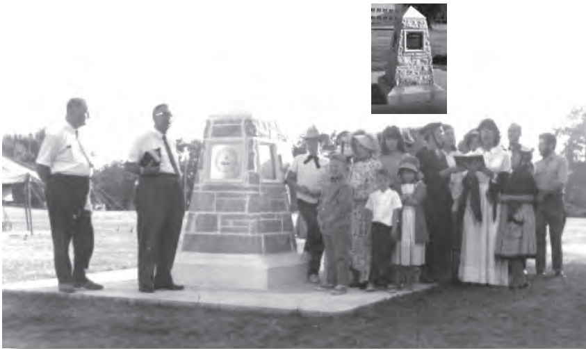
Photograph 27. Dedication ceremony of the Church of Christ (Temple Lot) marker commemorating the 100th anniversary since the return of church members to Jackson County, 1967. Inset: Historical marker, 1979.