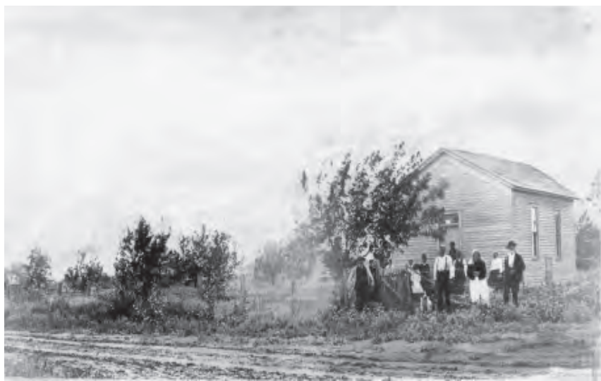
Photograph 1. Church of Christ (Temple Lot) 1889 meetinghouse, east side, ca. 1890s.

In 1887, after twenty years of discussing the matter of building a meetinghouse or small chapel on their property, members of the Church of Christ (Temple Lot) finally moved ahead with their plan. During the April 6 session of conference, the members agreed “that a committee of three be appointed to superintend the building of a house of worship and to locate the same on