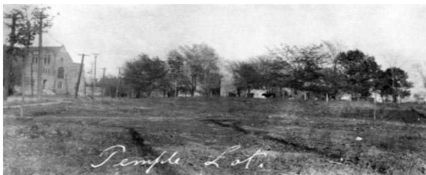
Photograph 8. View of the temple lot to the east, ca. 1904.

This view of the temple lot is to the east. Lexington Street and the RLDS Stone Church can be easily seen in the left of the photo. The west side of the Church of Christ (Temple Lot) can be seen through the trees, along with cattle grazing in the fenced portion of the property. The west end of the property shown in the foreground indicates that this portion of the temple property had not been maintained as well as the fenced portion of the site.