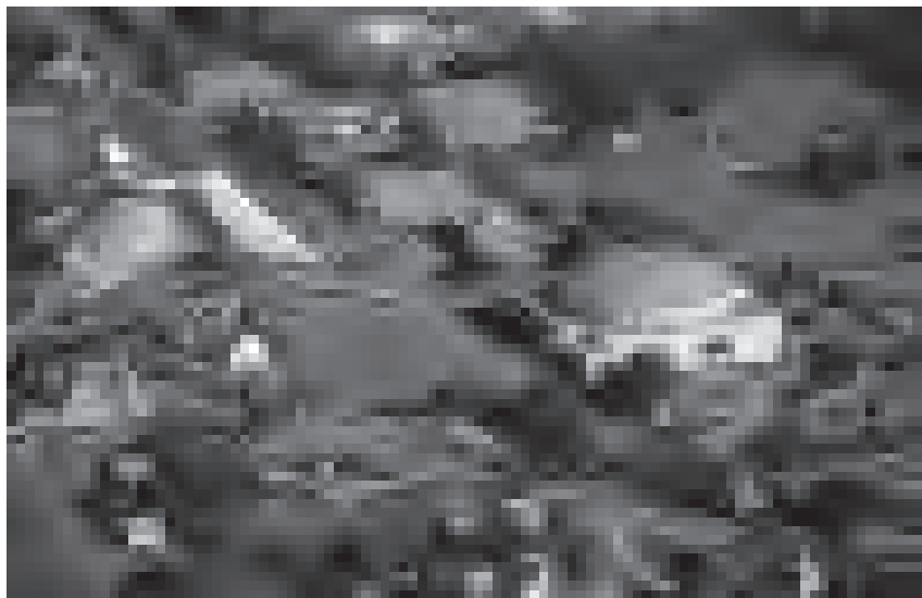
Photograph 32. Aerial view to the east-southeast showing the Church of Christ (Temple Lot) 1992 meetinghouse and surrounding properties, 2001.