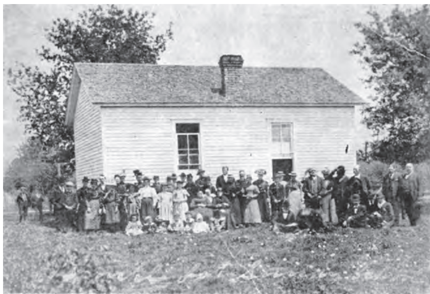
Photograph 2. Church of Christ (Temple Lot), 1889 meetinghouse, south side, ca. 1890s.

Sometime in the 1890s, fifty-two Church of Christ (Temple Lot) members posed on a hot Sunday afternoon for this photo. (Note the open windows.)