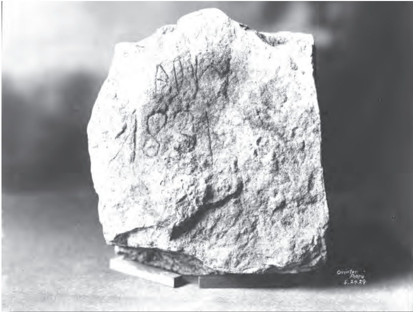
Photograph 19. Purported to be the northeast cornerstone temple marker, Grinter photograph, June 24, 1929. The inscription is believed to be a surveyor's marker indicating that the stone was placed forty feet west of the northeast cornerstone.