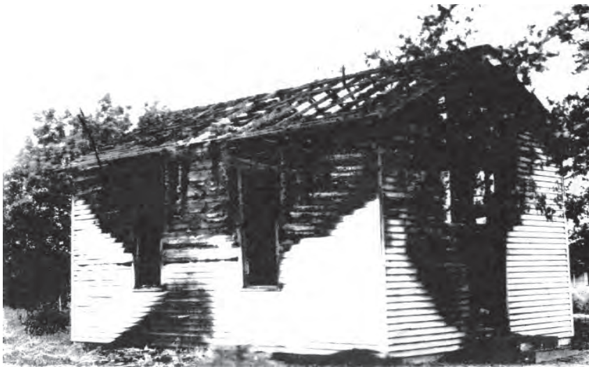
Photograph 6. Church of Christ (Temple Lot) 1889 meetinghouse (south and east sides) shortly after the September 4, 1898, fire.