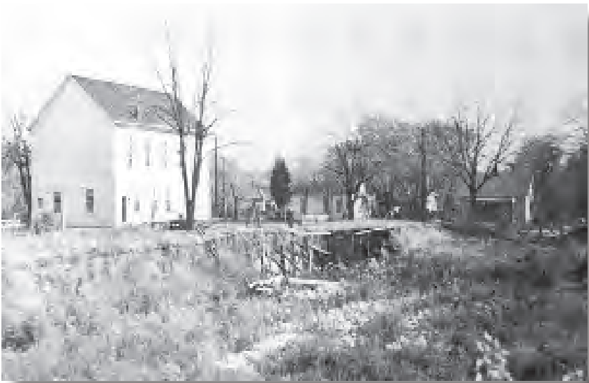
Photograph 24. View to the east showing the Church of Christ (Temple Lot) excavation, ca. late 1930s or early 1940s.