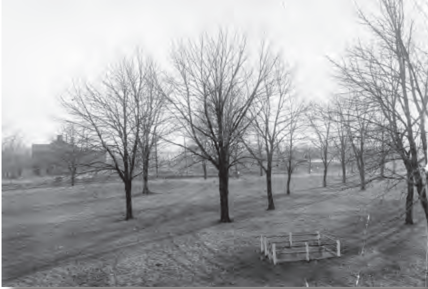
Photograph 16. View to the south-southwest of the temple lot. The 1927 image shows a fenced outdoor baptismal font constructed by the Church of Christ (Temple Lot).