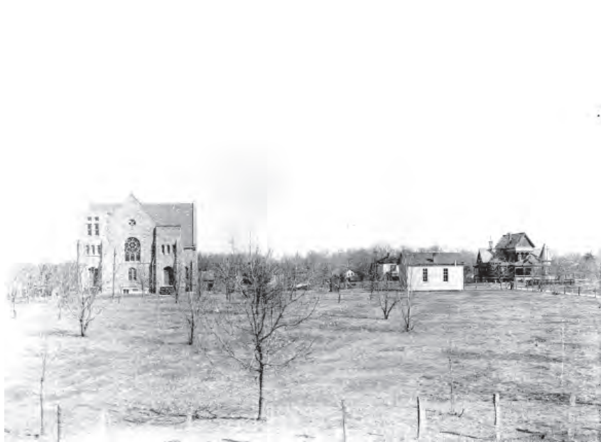
Photograph 3. View of the temple lot to the north showing the Church of Christ (Temple Lot) 1889 meetinghouse and the RLDS Stone Church, ca. 1890s.

This photograph of the temple lot shows almost the entire view of the two and one-half acres owned by the Church of Christ (Temple Lot). The view is to the north and clearly shows the 1889 Church of Christ (Temple Lot) meetinghouse and the RLDS Stone Church completed in 1892. Immediately behind and to the left of the Church of Christ meetinghouse is the home of C. A. Bishop. The large home shown to the right was owned by George Bartholomew. The photo was taken in the winter or early spring of the year, as evidenced by the fact that the trees are bare. One can see in the photograph the efforts made to beautify the temple lot property. When Joseph Smith Jr. dedicated the temple lot in August 1831, the property was heavily treed. In the intervening years following the expulsion of the Saints in 1833, the trees were cut down by local residents for their timber value. 16 The trees seen on the grounds were planted in 1883. 17