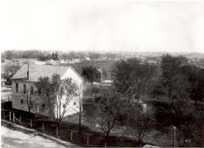
Photograph 10. View of the temple site property and Church of Christ (Temple Lot) meetinghouse to the south-southeast, April 26, 1907.