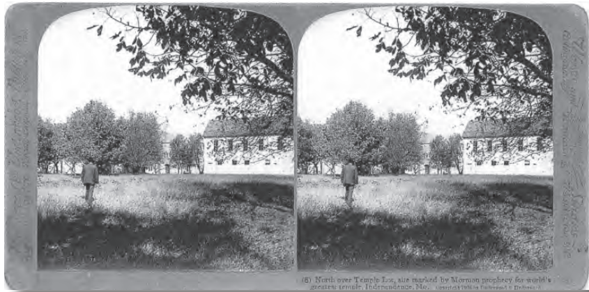
Photograph 9. Stereo view of the temple lot to the north-northwest, 1904, image produced by Underwood and Underwood Publishers. Photograph courtesy Bill Curtis.