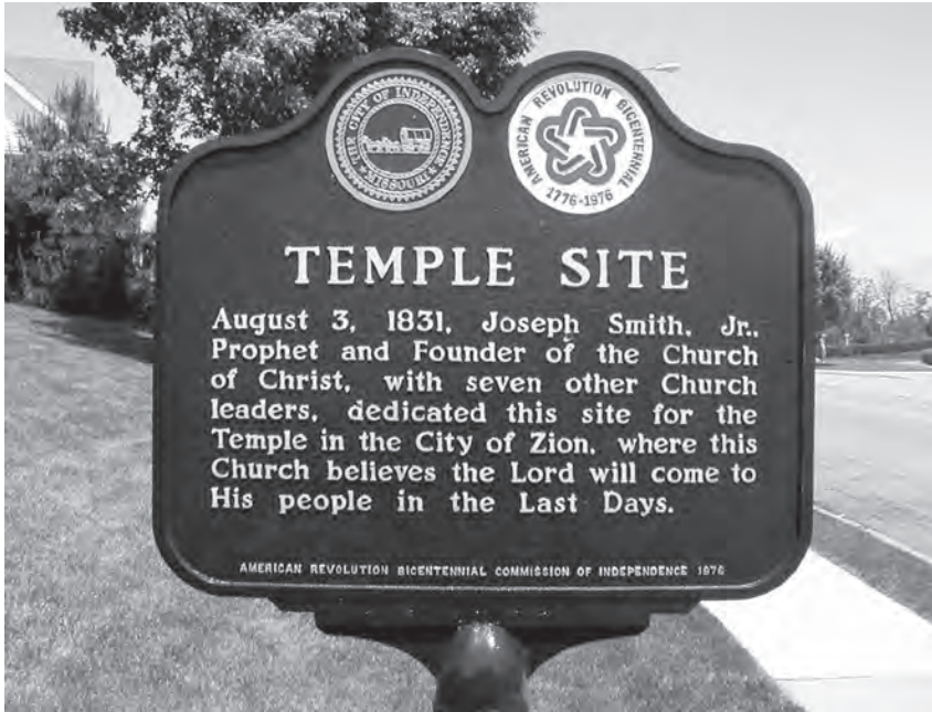
Photograph 28. City of Independence, Missouri, commemorative marker of the temple site, 2002.