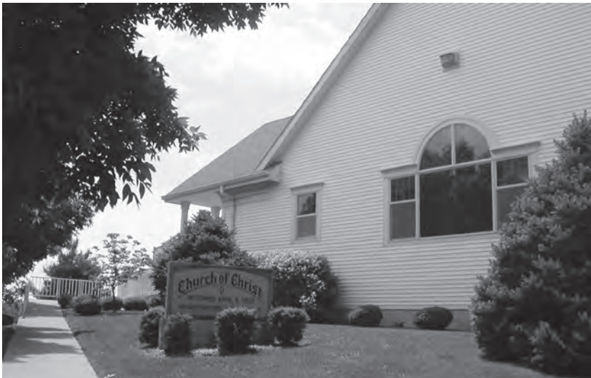
Photograph 31. View of the Church of Christ (Temple Lot) 1992 meetinghouse, east side, May 16, 2002.