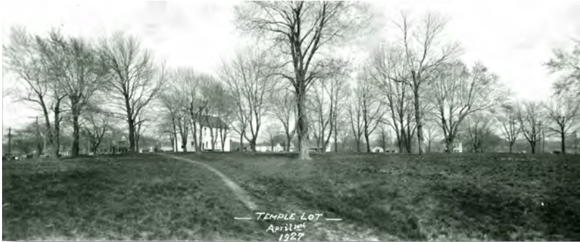
Photograph 14. Panoramic view of the temple lot to the northeast, April 30, 1927.