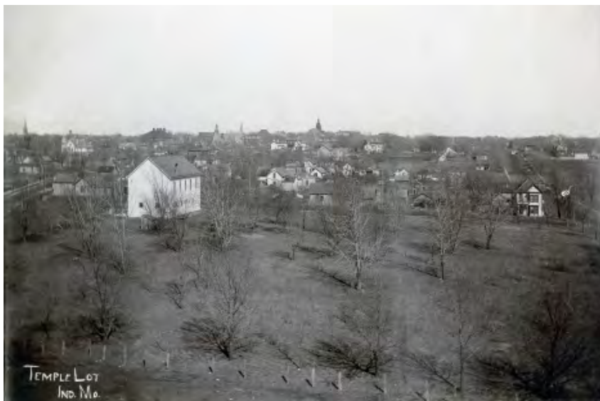
Photograph 7. View of the temple lot to the east, ca. 1902-1907, The Church of Christ (Temple Lot) 1902 meetinghouse and the tower of the Jackson County courthouse are visible in the photograph.