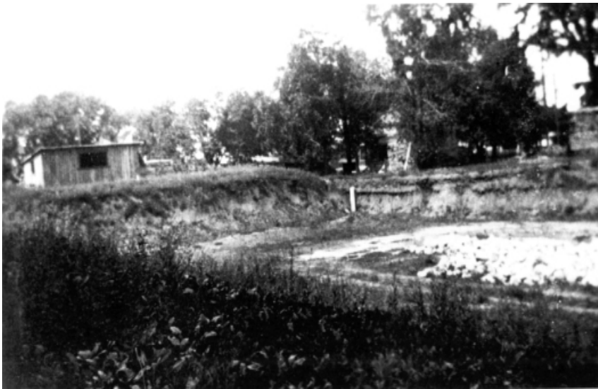
Photograph 25. View to the northwest showing the temple excavation, late 1930s to early 1940s.

Otto Fetting's "Fifth Message" called for the temple on the temple lot to be built in seven years. 44 However, the project never got any further than the excavation. By the late 1930s, the excavation became a property eyesore, full of loose rock, wild grasses, weeds, and rotting wood, as shown in this photograph by the late Wilford C. Wood of Bountiful, Utah.