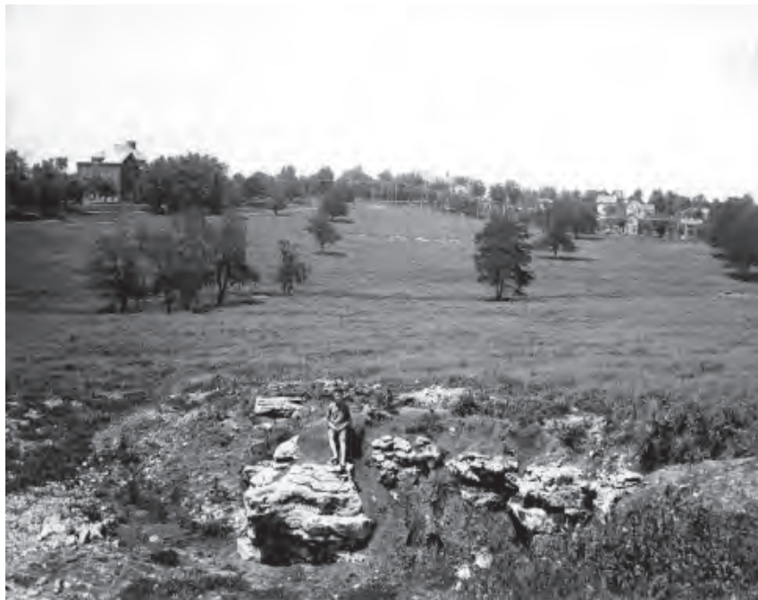
Photograph 11. View of the temple site to the north-northeast, ca. 1910.

Between 1900 and 1917 the Church of Christ (Temple Lot) experienced some growth in membership and dealt with internal dissent, but stalemated in its attempts to improve relationships with the Reorganized Church of Jesus Christ of Latter Day Saints. This photo of the temple site was taken about