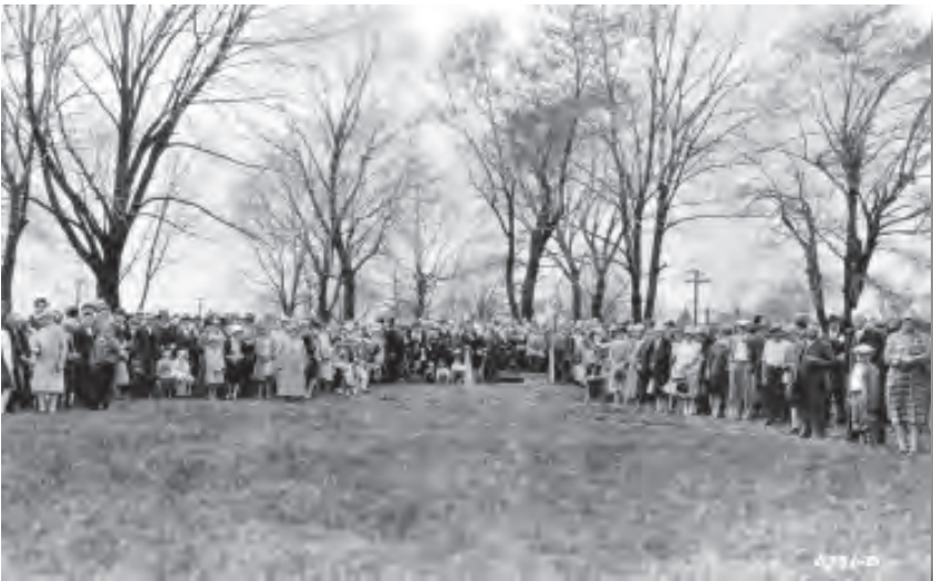
Photograph 17. View of the temple lot to the west with members of the Church of Christ (Temple Lot) assembled for the ground-breaking ceremonies of the temple, April 6, 1929.