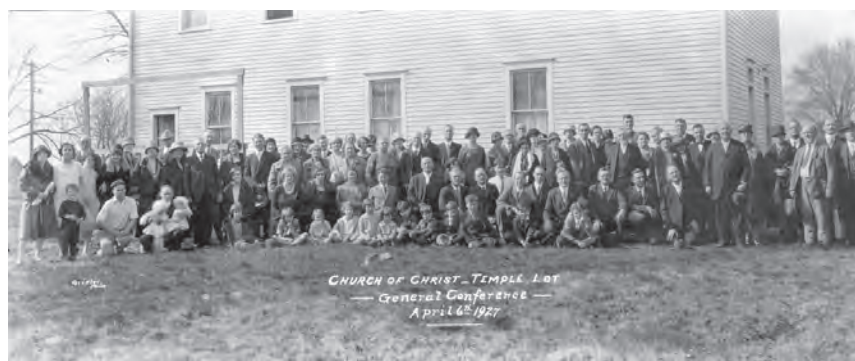
Photograph 13. Members of the Church of Christ (Temple Lot) assembled on the south side of the 1902 meetinghouse, as part of the April 6, 1927, general conference.

The April 1927 conference of the Church of Christ (Temple Lot) was “abuzz” with the announcement that Otto Fetting, one of the recently ordained apostles, had received revelations or “messages” (from a divine being who identified himself as John the Baptist) regarding the fulfillment of Malachi’s prophesy (Malachi 3:1), and that the building of the “long-awaited” temple was to soon commence. 28 This group photo, while only a portion of the total membership of the church, is representative of the significant growth experienced by the Church of Christ during the period 1918–29. The growth was primarily the direct result of “transfers” from the RLDS church, a practice that was permitted at this time in accordance with the “Agreements of Working Harmony.” 29 Before 1918, the Church of Christ (Temple Lot) membership was estimated at two hundred. 30 However, between 1918–29, it is estimated