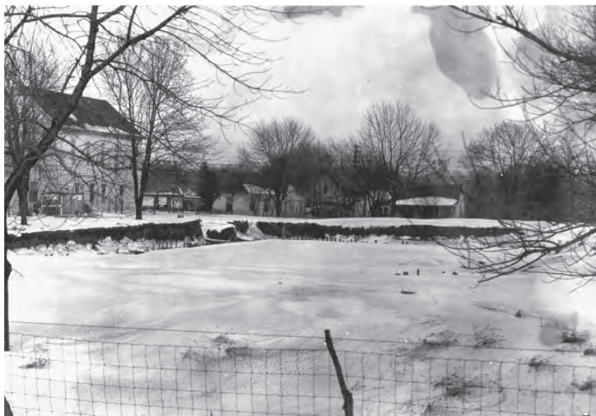
Photograph 22. View to the east showing the Church of Christ (Temple Lot) temple excavation, ca. 1929–1930.

Christ (Temple Lot) officials maintain that both the surveyor's stone and the southeast marker stone are genuine. 39 Both stones are prominently displayed in the Church of Christ's (Temple Lot) visitors' center located in the basement of the Independence meetinghouse. In addition, cement markers have also been placed on the temple lot to identify the locations where the stones were discovered.