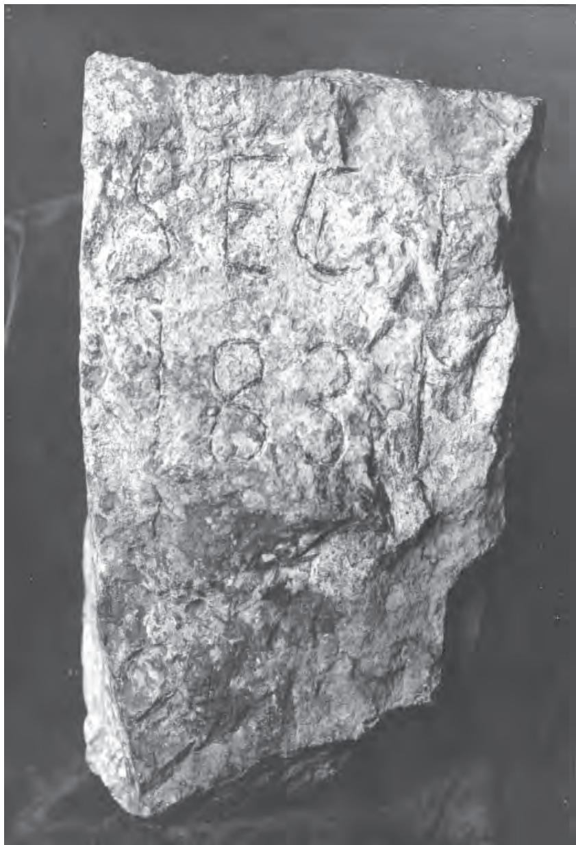
Photograph 21. Southeast cornerstone temple marker, discovered June 26, 1929. The above photograph was taken March 29, 1930. Church of Christ (Temple Lot) officials believe the inscription "SECT 1831" to stand for "South East Corner Temple 1831."