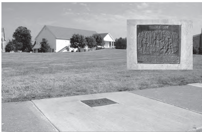
Photograph 33 and inset. View to the north showing the Church of Christ (Temple Lot) 1992 meetinghouse and the in-ground marker placed by the Missouri Mormon Frontier Foundation (May 25, 2000) situated on the south sidewalk of the temple lot, 2000.