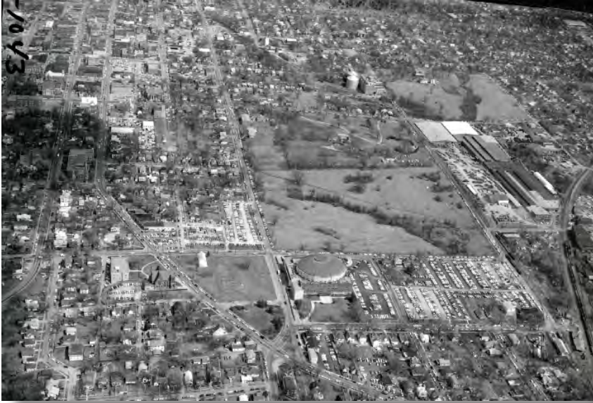
Photograph 26. Aerial view to the east showing the temple lot (including the filled-in excavation) and the surrounding RLDS (Community of Christ) and LDS properties, ca. 1950s.