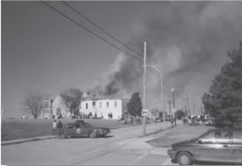
Photograph 30. View to the north showing the Church of Christ (Temple Lot) meetinghouse on fire, January 1, 1990.