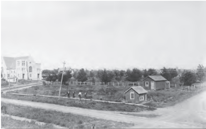
Photograph 12. View of the temple lot to the northeast, early 1900s.

This photograph, taken in the early 1900s, is a view of the temple lot to the northeast and was probably taken from the second story window or rooftop of a two-story commercial building (later called the Star Market) located on the southeast corner of Walnut and Lexington Streets. The four men and the boy in the photograph are likely members of the Church of Christ (Temple Lot). Several features stand out in the photograph. The most noticeable are the two outbuildings constructed on the southwest corner of the temple lot, used as storage sheds for tools and equipment. 24 It is not known when these structures were built or removed. Also noticeable is the dirt road or street that has been cut, running directly north and south (subsequently called “Temple