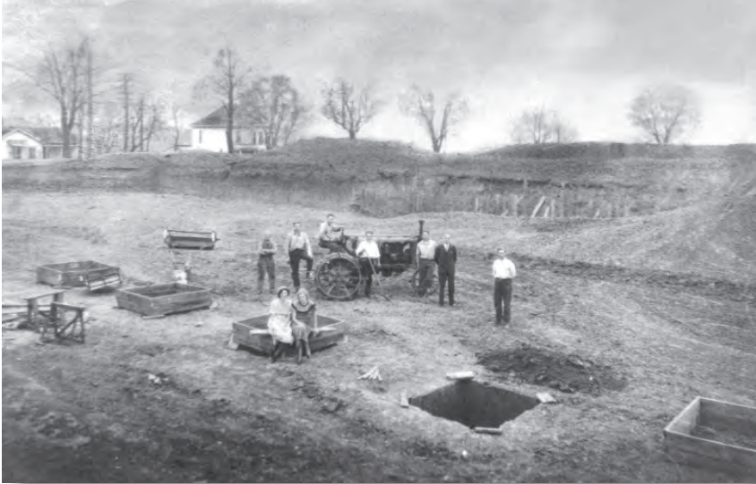
Photograph 23. View to the southeast showing the temple lot excavation, 1933.