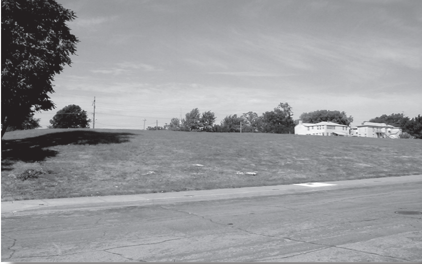
On the evening of May 6, 1842, an assassination attempt was made against ex-Missouri Governor Lilburn W. Boggs at his home site situated on South Spring Street in Independence, Missouri (pictured above), 2000.