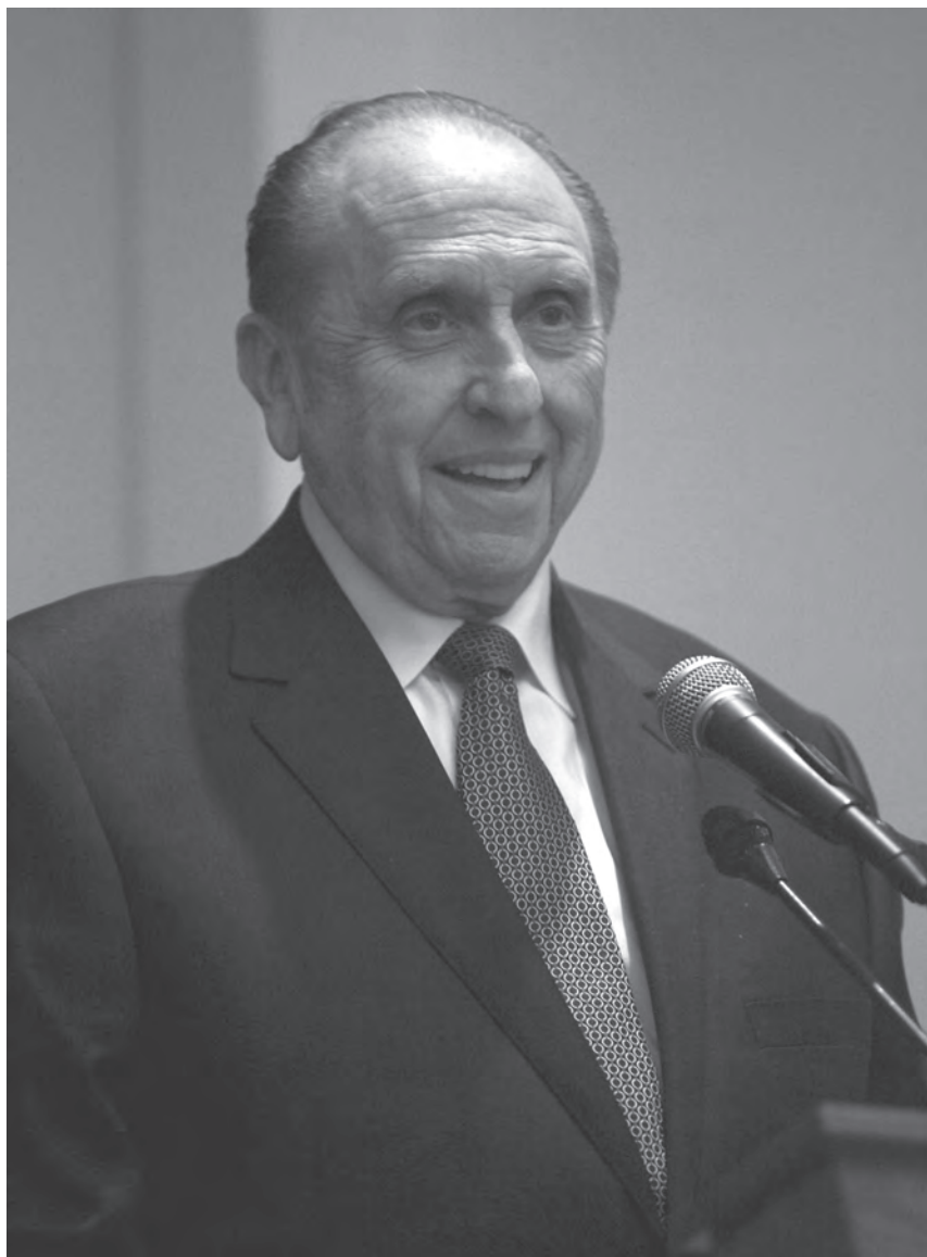
President Thomas S. Monson, President of The Church of Jesus Christ of Latter-day Saints, speaking at the Wilford C. Wood banquet, May 28, 2009.