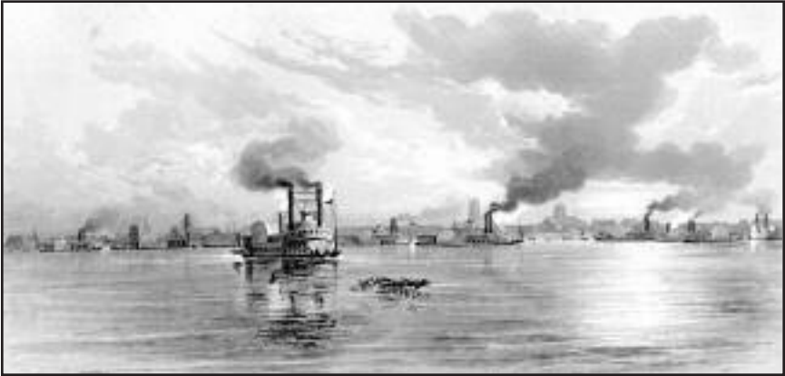
New Orleans, by Frederick Piercy, Route from Liverpool

If he possessed sufficient money to pay his passage upstream, he could immediately tranship himself with his luggage to a river steamboat and continue his journey inland. If he had sufficient funds to pay his passage, he could take a position at New Orleans until such time as he had accumulated sufficient money to defray the cost of transportation upstream. If he landed destitute, there was no alternative, but to look for employment and to trust to charity to support him in the meantime. 52