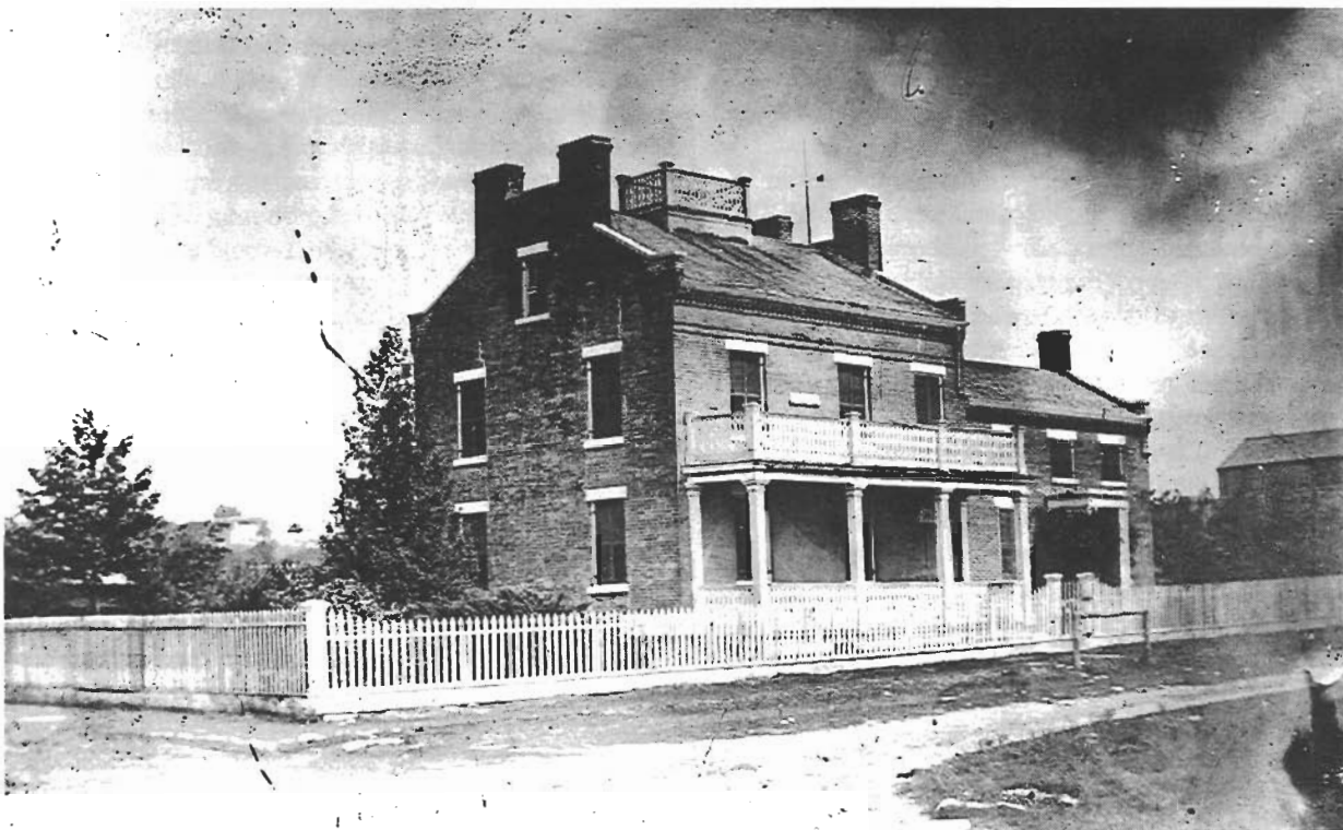
Heber C. Kimball Home, Nauvoo, Illinois

As Rogers (author of “Pleasures of Memory”) says, “He who feels the infirmities of age, dwells most on