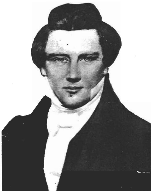
Joseph Smith, Jr.

The Latter-day Saints have always been accused by the world of denying the Old Bible and substituting a new one, which they were pleased to call "Joe Smith's Golden Bible." I will here mention one circumstance: a cousin who lately paid me a visit from the States, seemed very much surprised at seeing upon my table the old family Bible, which happened to be her "Uncle Heber's." I merely speak of this to show how little the Gentile world know about us, or can understand the faith and doctrines of the people whom they are so ready to judge.