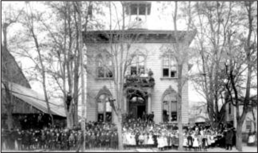
St. Mark's School in Salt Lake City, Utah

land is to be saved . . . to civilization and Christianity, the children must be taught in civilized Christian ways. Remember that, without such teaching and training, the children will of course, accept Mormonism and polygamy.” The missionaries went on to say, “We are the only Christian missionaries in the territory. . . . The great feature of the work is in teaching and training children.” They then pleaded for $15,000 to build a schoolhouse, even before they asked for contributions to build a chapel. 25